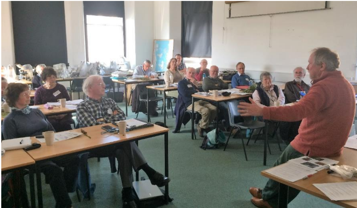
Spring Recording Conference at RBGE in 2019