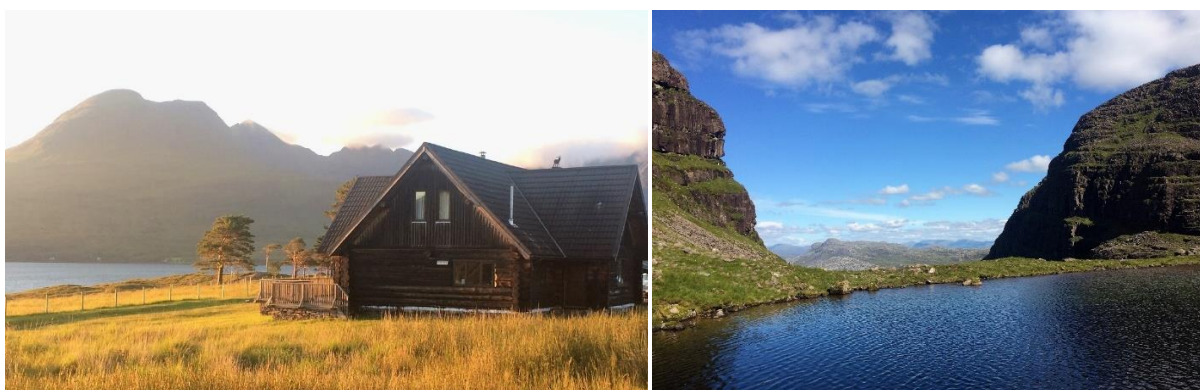
Ben Damph Lodge, base for our Recording week in Torridon (left) and Coire na Poite, Beinn Bhan, Applecross in one of the areas we recorded (right).