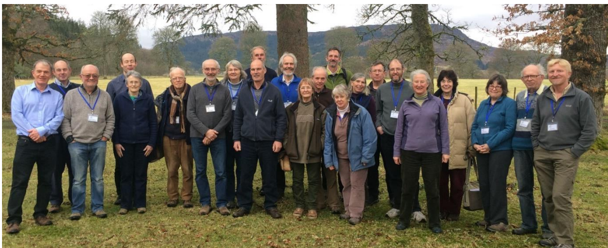
Recorders Conference, March 2017 at Kindrogan Field Studies Centre

Twenty-six recorders participated in a very successful residential weekend Recording Workshop at Kindrogan FSC. Progress with Atlas 2020, data validation, MapMate and making our data public were all on the programme . All the presentations are still available on the Scottish Conferences webpage.