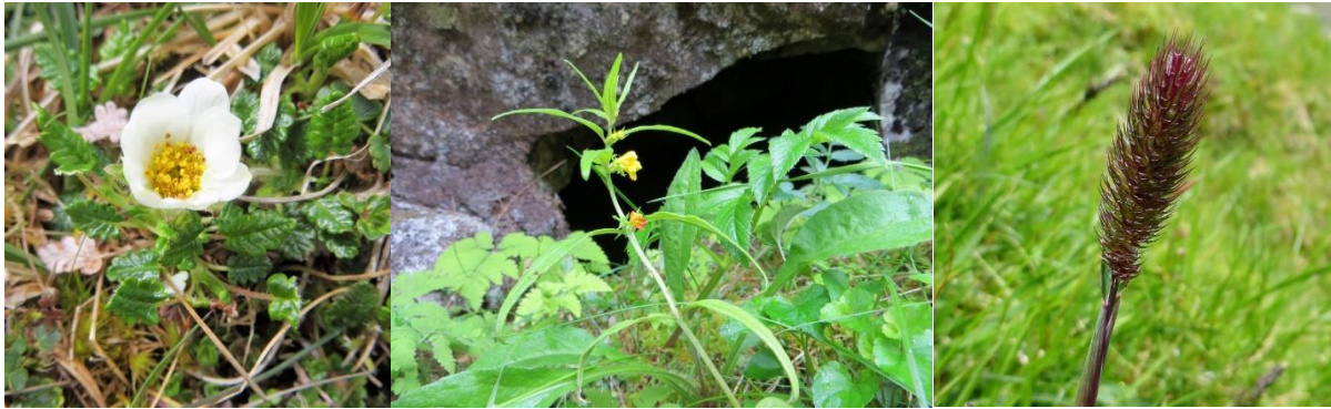
Dryas octopetala (Mountain Avens), Melampyrum sylvaticum (Small Cow-wheat) and Phleum alpinum (Alpine Cat's-tail), Glen Affric, 2017