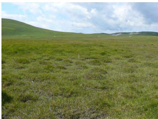
Great Close Mire near Malham Tarn, Mid-west Yorkshire, one of a small number of locations for Polygala amarella .

Polygala amarella is a small, ascending to erect milkwort with a distinct basal rosette of obtuse, spoon-shaped leaves. The stem leaves are usually much smaller and more acute. Plants in the north of England have sky-blue, purplish-blue or pink flowers whereas those in Kent are all pale mauve to greyish-white. The veins on the inner sepals rarely reconnect (anastomose), unlike in P. vulgaris and P. serpyllifolia , and never along the petal margin. Unlike all other British Polygala species the leaves have a distinct bitter after-taste. Two geographical races occur in Britain and are probably best treated as subspecies: subsp. amarella in northern England and subsp. austriaca in Kent (Rumsey 2009).