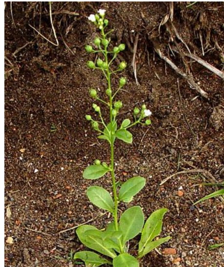
Brookweed ( Samolus valerandii )