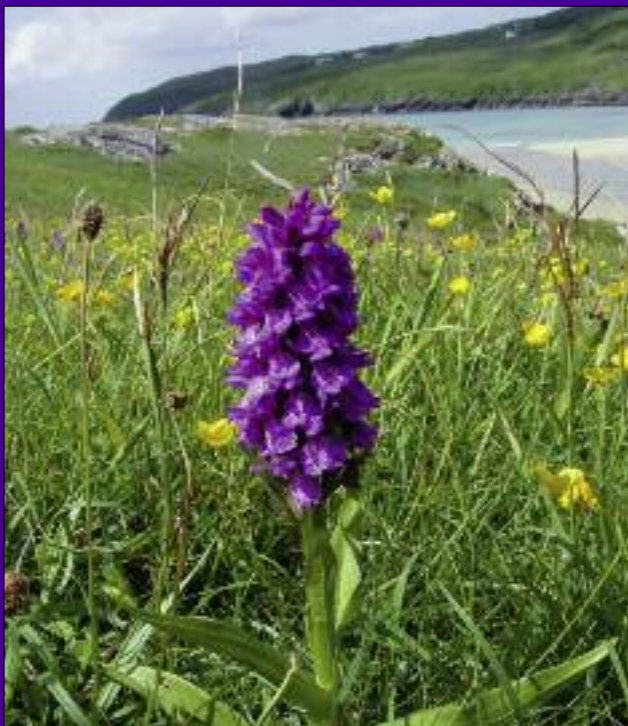
Irish Marsh-orchid ( Dactylorhiza kerryensis )

We publish essential identification handbooks and atlases of the British & Irish flora; we help fund local Floras and county Rare Plant Registers.