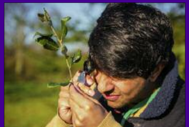
Looking for key identification features

BSBI Membership, 41 Marlborough Rd., Roath, Cardiff, Wales. CF23 5BU. Tel.: 02920 332338