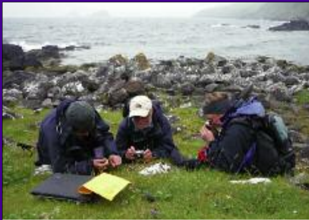
Recording wild plants across Britain and Ireland

Two dedicated Referees to support our beginner botanists.