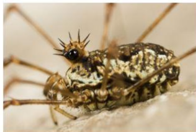
Female Megabunus diadema