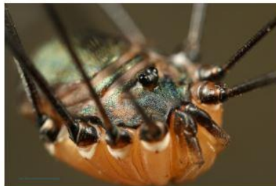
Male Leiobunum sp. A

The keys presented here are not traditional dichotomous