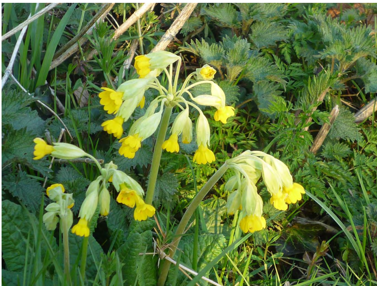
Cowslip ( Primula veris )

( http://www.bsbi.org.uk/Irish_Species_Project_John_Faulkner.pdf ). The selected species, including Cowslip, were scarce but not rare, thought to be in decline and easily identifiable. Cowslips are a typical species of calcareous grassland and have a widespread distribution in the midlands of Ireland including Laois. This is to be expected as Laois has limestone bedrock and is predominately made up of Limestone-based sub-soils and soils, although not all regions.