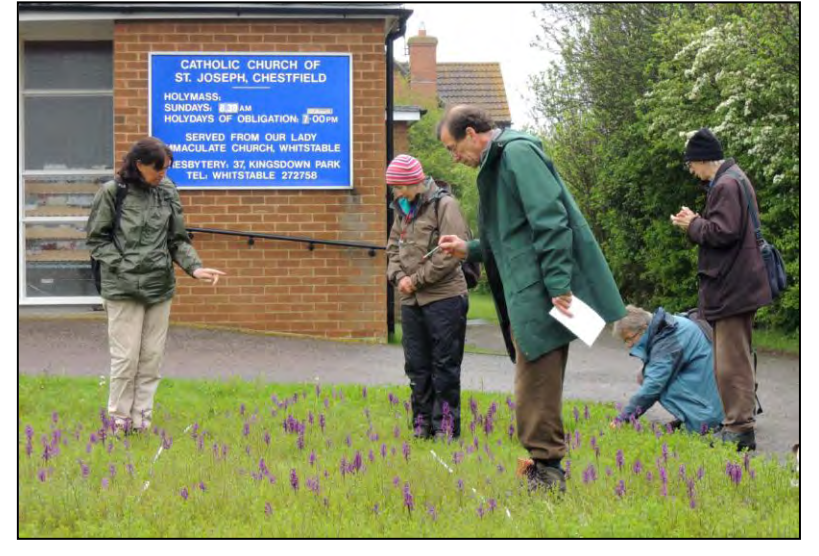
Left: counting orchid spikes

We had not even got away from the cars, when Poa infirma (Early Meadow-grass) was found scattered along the road verge. At the usual botanical pace, we eventually covered the few metres required to reach St Joseph's (R.C.) church. The building is modern but the front lawn may be much older and a residue of neutral grassland. The area was punctuated with the purple of Anacamptis morio (Green-winged Orchid) flowers. A survey for the BSBI's Threatened Plants Project was carried out: we counted 535 spikes and listed the 15 vascular plant species to be found within one metre of a sample spike. We are grateful to John Puckett (unfortunately unable to be present that day), who had arranged matters with the church authorities and kept mowers away.