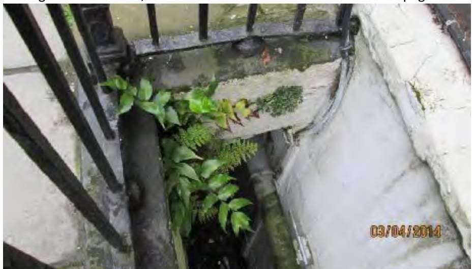
Cyrtomium falcatum, Ely Place, Dublin. See page 20.