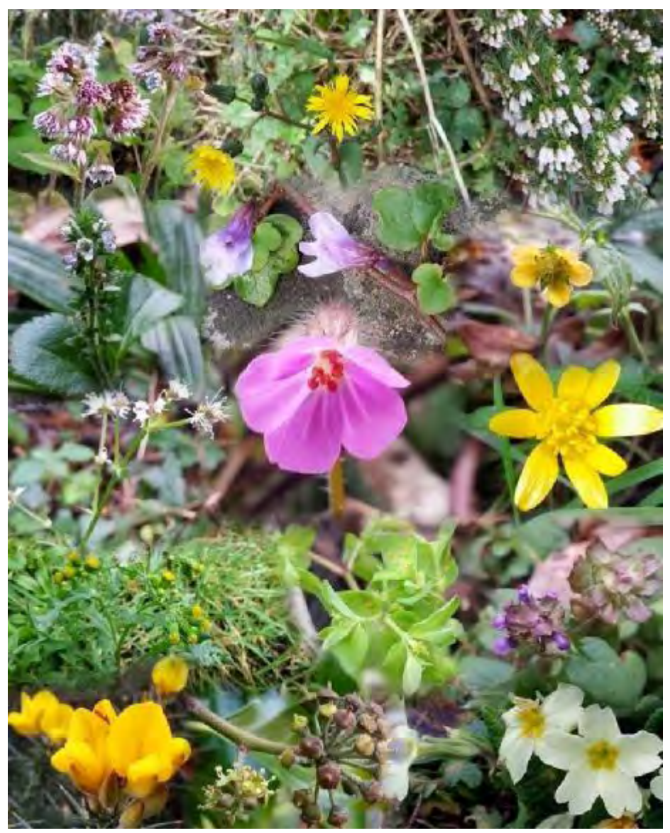
Image courtesy of Glengarriff Nature Reserve, Co. Cork. See page 9.