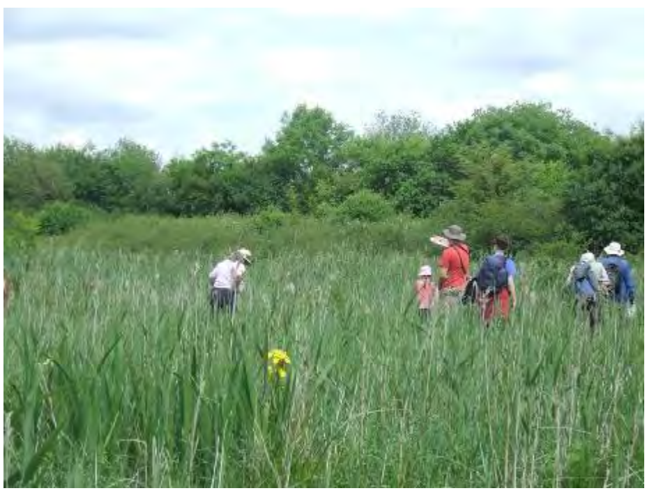
Loughbarra Wetland, 21 June. See page 53.