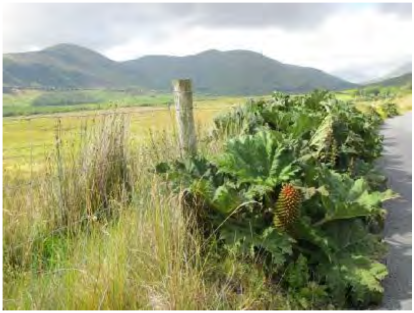
Above: Gunnera tinctoria, Leenane-Maam Road, Galway. Below: G. manicata, Kevin Blehein's garden. See page 15.