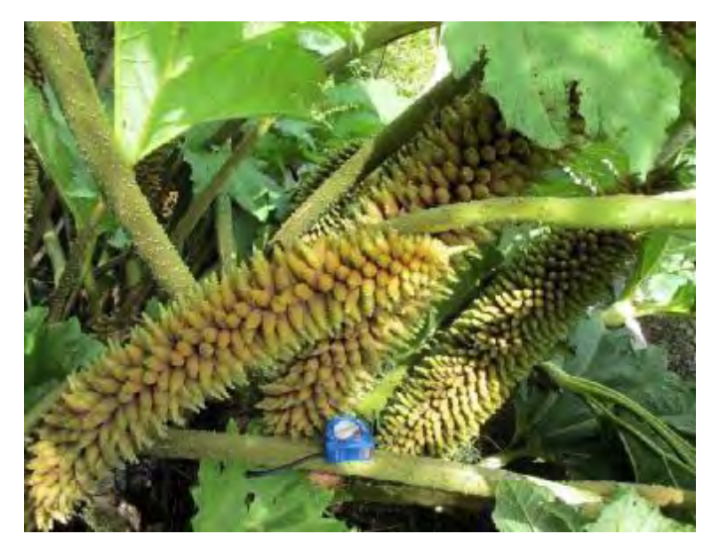
Above: Gunnera tinctoria, Leenane-Maam Road, Galway. Below: G. manicata, Bunbeg, Donegal. See page 15.