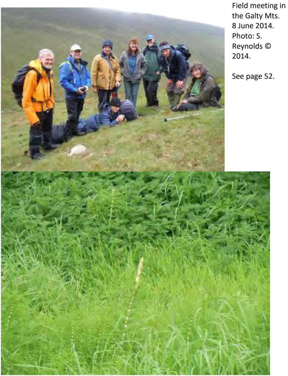
Vegetative Equisetum telmateia (Great Horsetail), unusually with a cone, near Duntryleague, Co. Limerick, August 2014. See page 45.