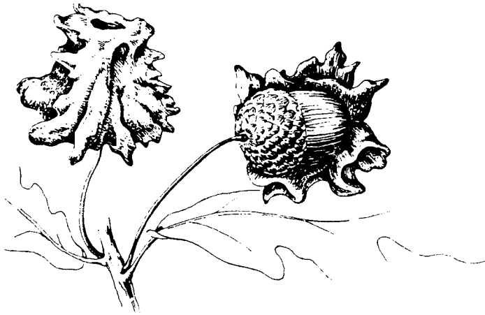
A knopper gall formed by Andricus quercuscalicis on an acorn of Quercus robur .