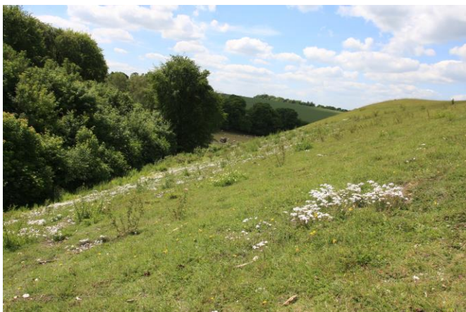
Iberis amara flowering in rabbit scrapes at Church Hill, Therfield Heath, Hertfordshire.

Stems (up to 40 cm tall) are erect, sparsely covered with simple hairs and branched above, bearing a crowded corymbose inflorescence that elongates in fruit (Rich, 1991). The outer flowers are much larger than the inner ones, and each flower is noticeably asymmetrical, having two outer (abaxial) white (sometimes lilac) petals that are much larger than the two inner (adaxial) ones. Busch et al. (2014) describe