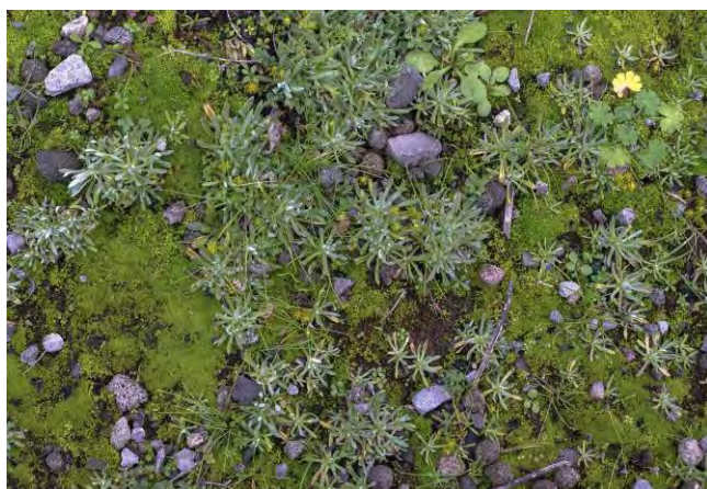
Overwintering (seedling) rosettes of Filago vulgaris at Baglan Bay, Neath Port Talbot.

Plants are often regularly branched above the middle of the main stem, forking into 2-3 branches below each cluster of capitula (Rose 2006; Stace 2010). Capitula (5 × 1.6 mm) are in quite neat and dense ±globose clusters of (15)20-c.40 (Davis 1975). Clusters measure c.10-12 mm across and are