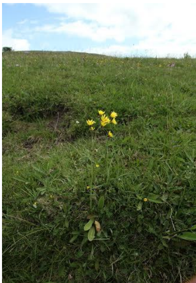
Crepis praemorsa at Orton Pasture SSSI, Westmorland

Crepis praemorsa has a rosette of yellowish-green basal leaves (5–20 × 1.5–5.5 cm) that are entire in the upper half but shallowly denticulate in the lower half, hispid-hairy on the upper side and much more so on the lower side. Hairs are simple, short, and often bent or strongly curved (Roberts, 2009). Leaves are broadest near the tip, gradually (sometimes abruptly) narrowing to the base (i.e. obovate) and have a blunt, rounded leaf-tip that is minutely apiculate (Halliday, 1997; Stace, 2010). The leaf-blade often becomes slightly concave, resembling a wide and very shallow boat (Roberts, 2009).