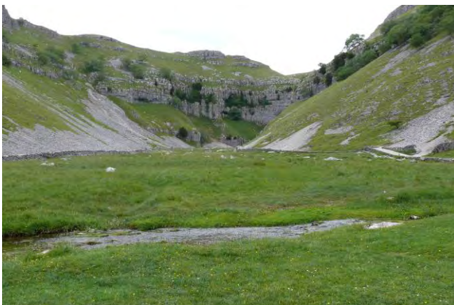
Streamside habitat of Blysmus compressus at Goredale Scar, North Yorkshire.

Blysmus rufus has a darker-brown inflorescence and narrower and shorter rush-like leaves (1.5 cm–15 cm × 0.4–1 mm) that are rolled inwards at the margins.