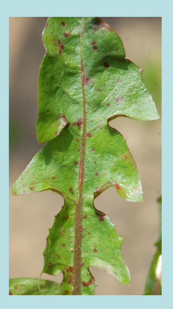
No, feeding damage T. sahlinianum