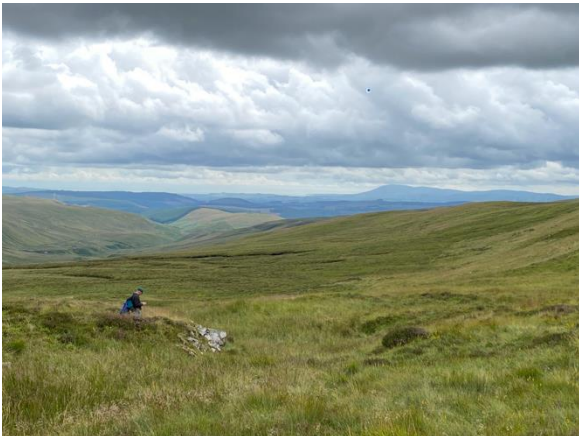
View south from the watershed