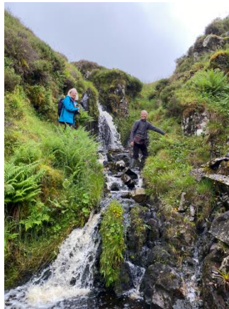
By the Crow Burn, where Saussurea alpina was re-found