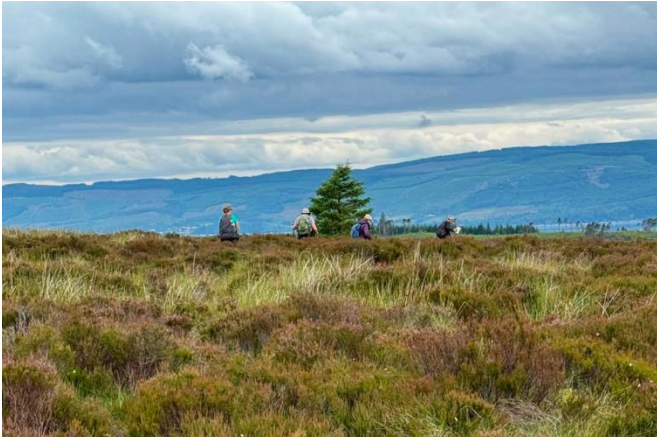
Hunting among the Heather for Neottia cordata . . .