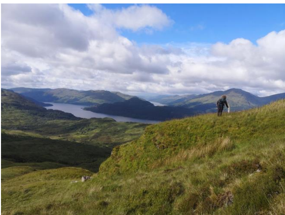
Wild mountain country with huge views