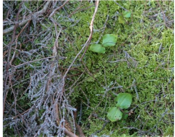
. . . success!