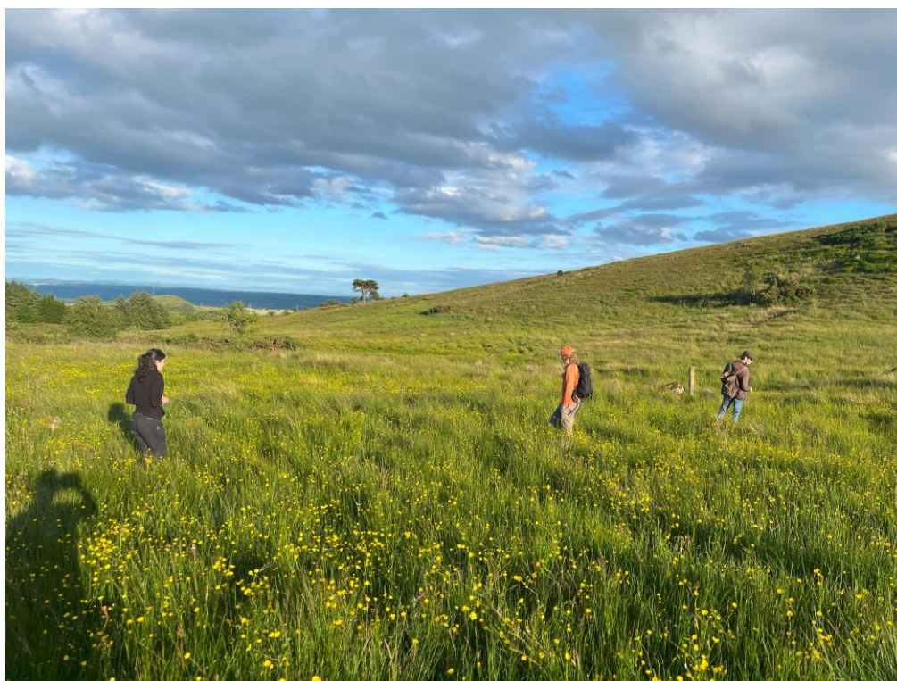
The team searching for Lesser Butterfly-orchid ( Platanthera bifolia ) in the species-rich rush-pasture