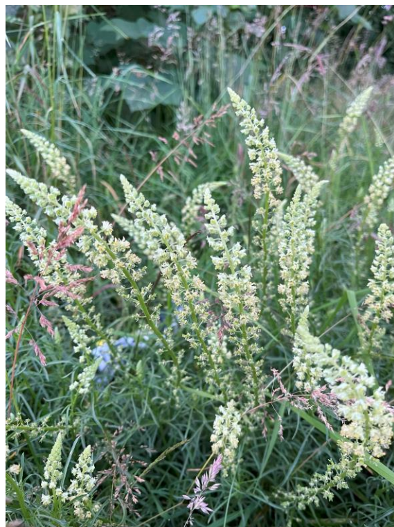
Wild Mignonette ( Reseda lutea ) at its only post-2000 site in Stirlingshire, by the road in Fankerton, present and correct on the way home from Denny Muir! It has been recorded from a few sites in West Perthshire as well, but is rare or scarce across our area.