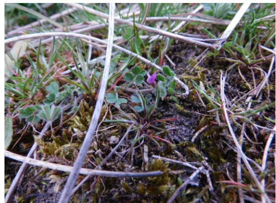
Vicia lathyroides ( Spring Vetch)