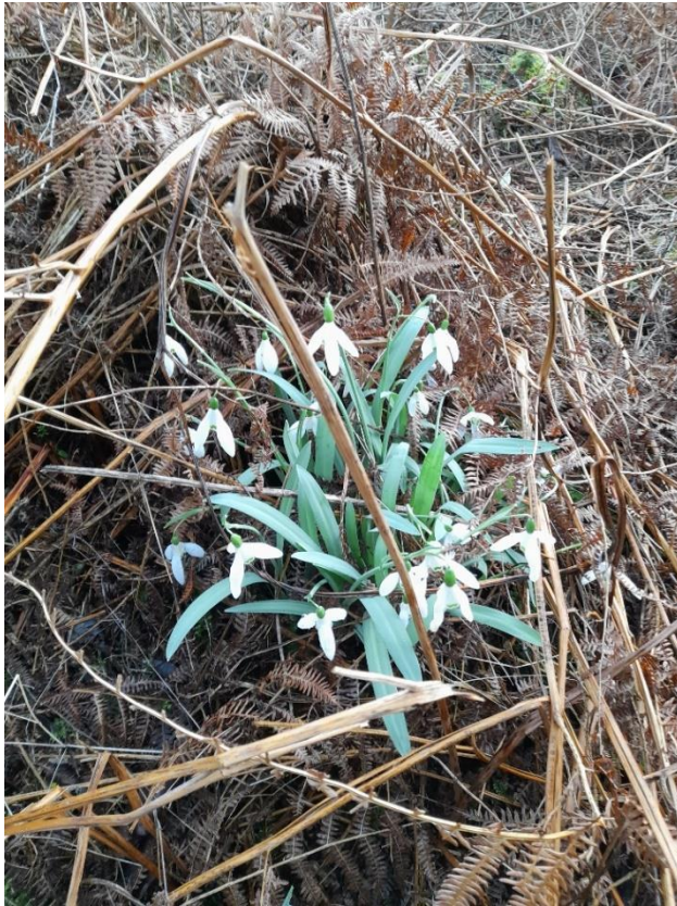
Galanthus nivalis x elwesii (Snowdrop x Greater Snowdrop)