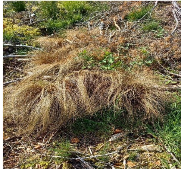
Photos showing the flowering stems and habitat of New Zealand Hair-sedge