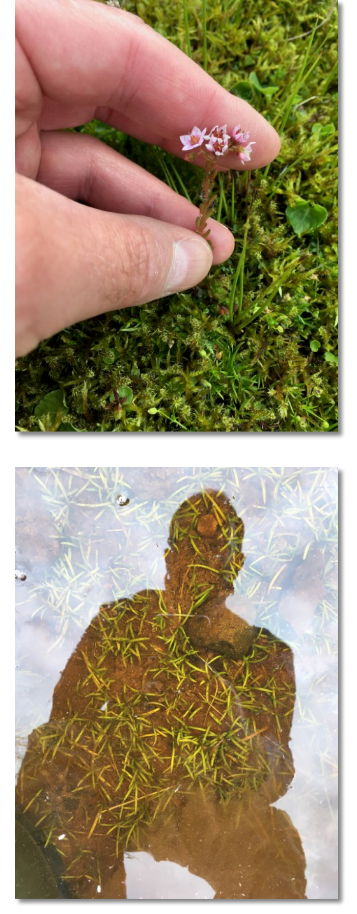
Upper right: Sedum villosum (Hairy Stonecrop) Lower right: Littorella uniflora (Shoreweed)