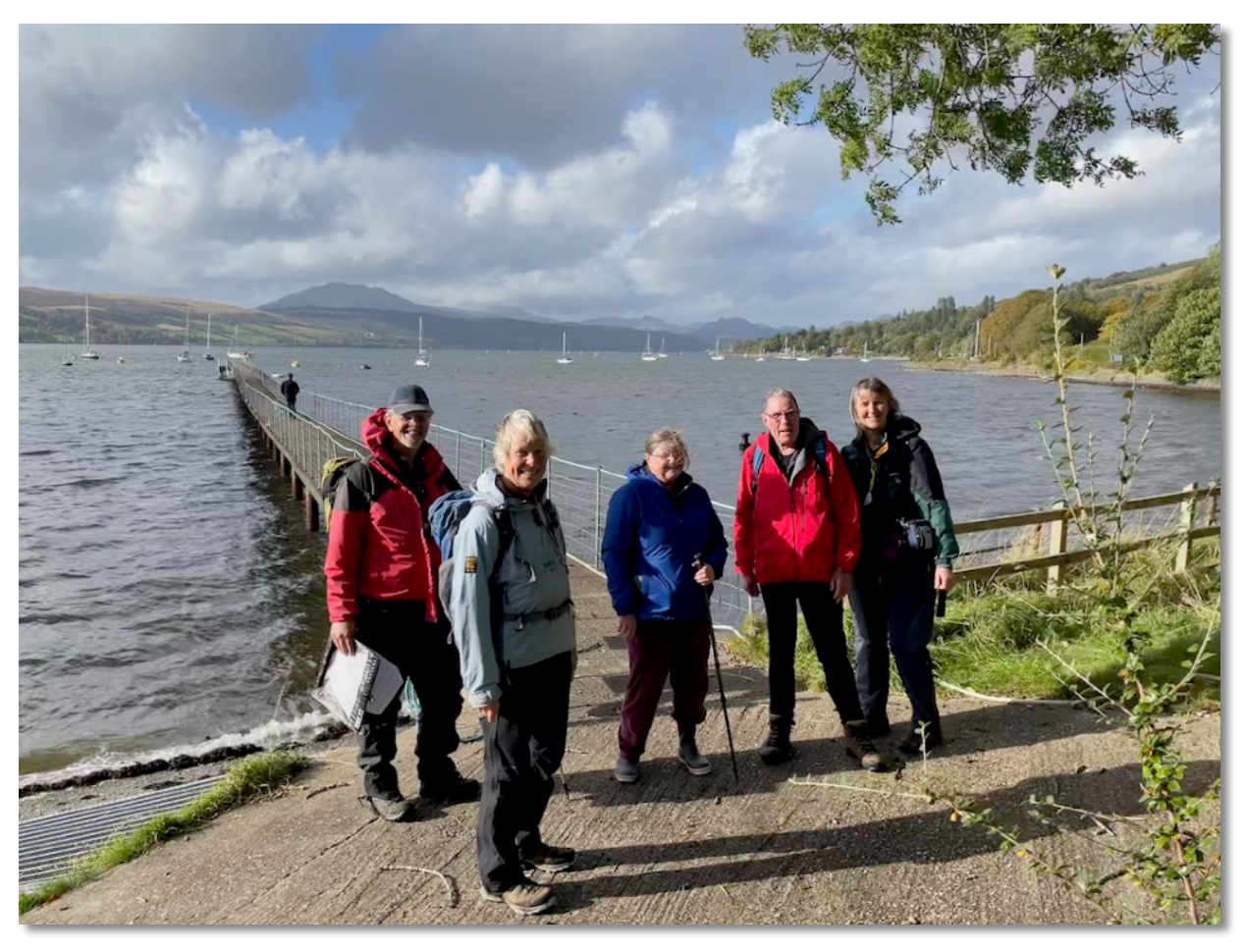
Team photo at Rhu on the final outing of the season

We've been to many wonderful places this year, with 20 programmed group outings supported by lots of individual work and spontaneous get-togethers. As a result, we've recorded 923 species across 246 monads and achieved thorough records for a further 63 monads - meaning that we're ahead of target to cover the entire vice-county afresh by 2030.