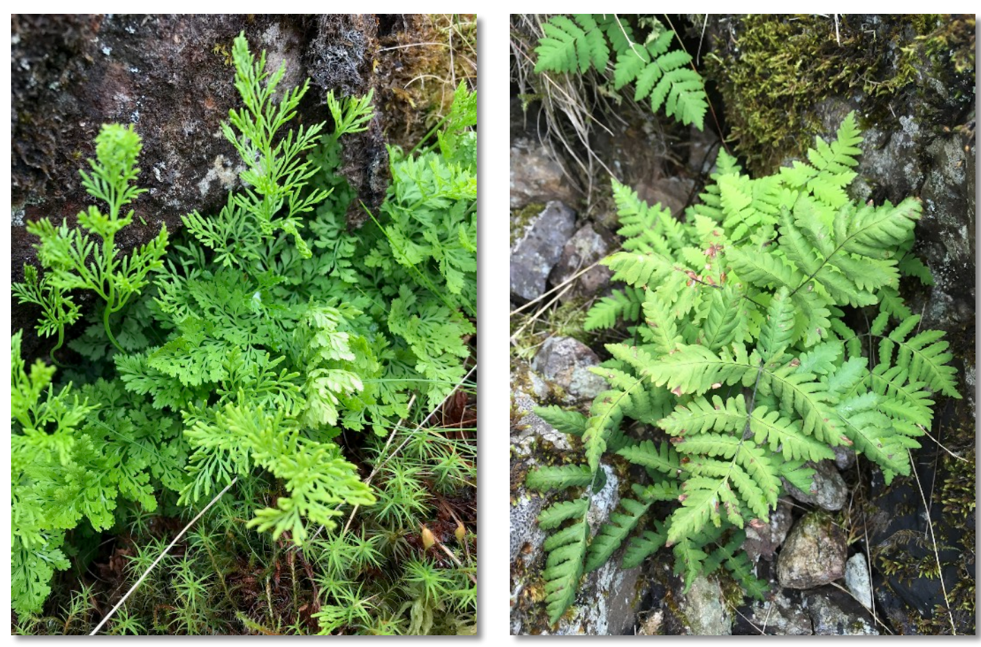
Cryptogramma crispa (Parsley Fern)