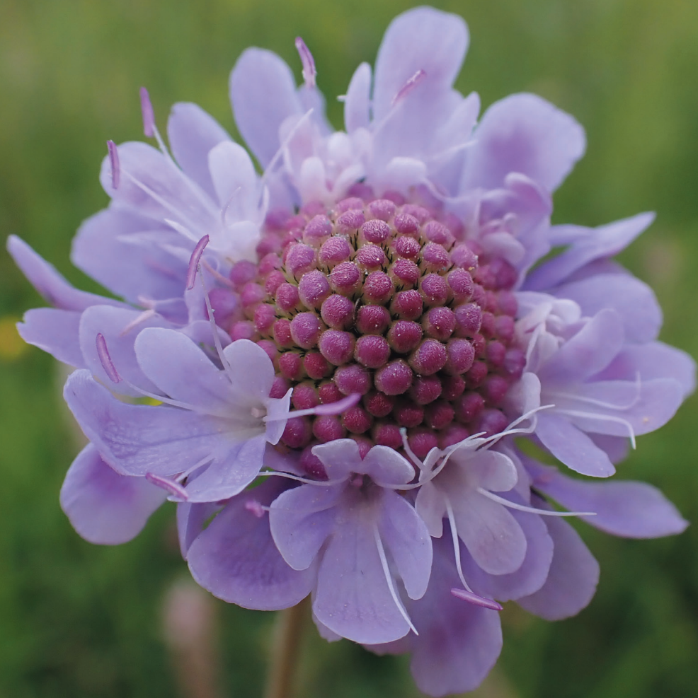
Small scabious Scabiosa columbaria in Bishop Middleham

bsbi.org/state-of-the-worlds-plants-fungi-2020