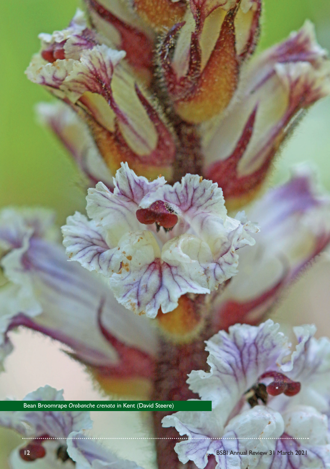
Bean Broomrape Orbanche crenata in Kent (David Steere)