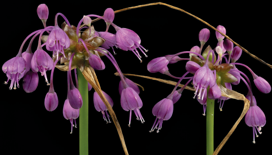
Keeled garlic Allium carinatum in Musselburgh