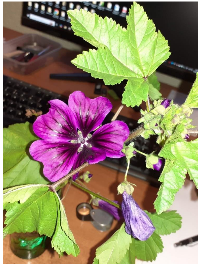
Malva sylvestris Morley A Willmot

Another name for this large grass is Elephant-grass which is rather apt as it can grow to 4 metres tall. Two clumps were found in September by Mick Lacey growing in a grass verge alongside a railway line at Langwith (SK5269). It is being increasingly grown as a biomass crop and sometimes as a garden ornamental. It rarely flowers so these plants were probably garden throwouts.