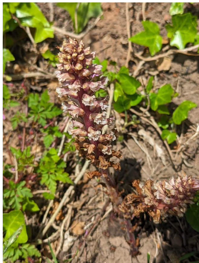
Orobanche hederæ Chaddesden