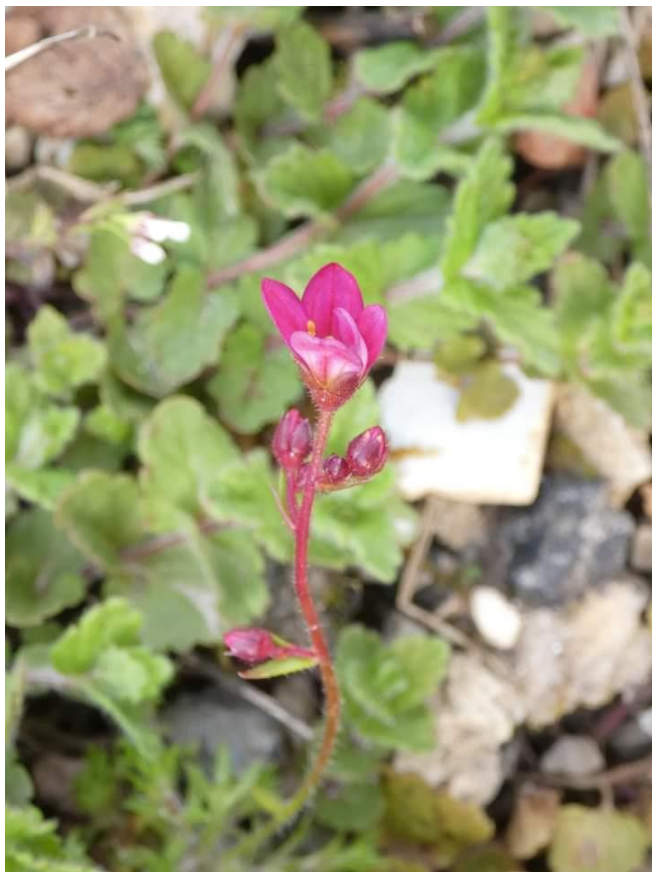
Saxifraga 'Arendsii' Laporte Mine