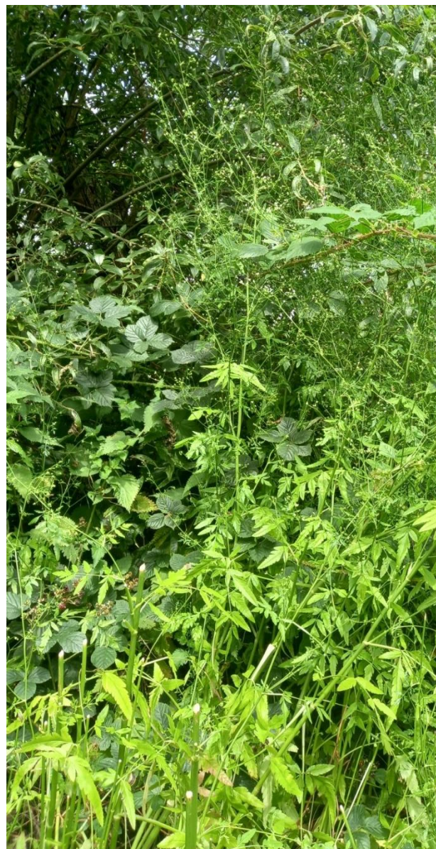
Sison amomum Willington

There had been no records for this species locally since 2003 when it was recorded from three sites in the county last year. These were; Willington (SK2828), Ashbourne (SK1746) and Junction 25 on the M1 (SK4735).