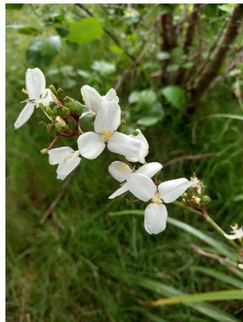
Libertia formosa SK4275