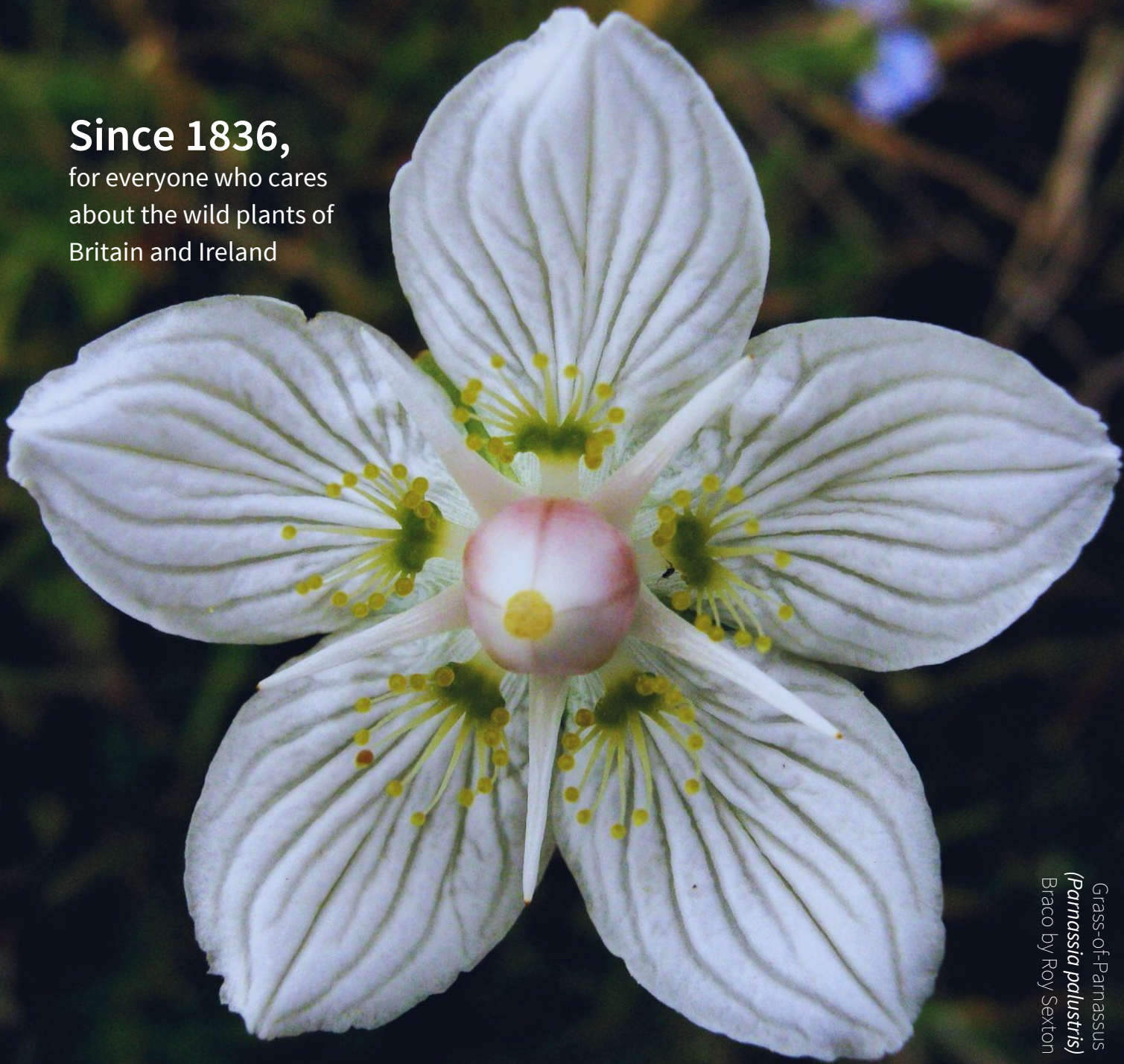
Grass-of-Parnassus ( Parnassia palustris) Braco

Since 1836, for everyone who cares about the wild plants of Britain and Ireland