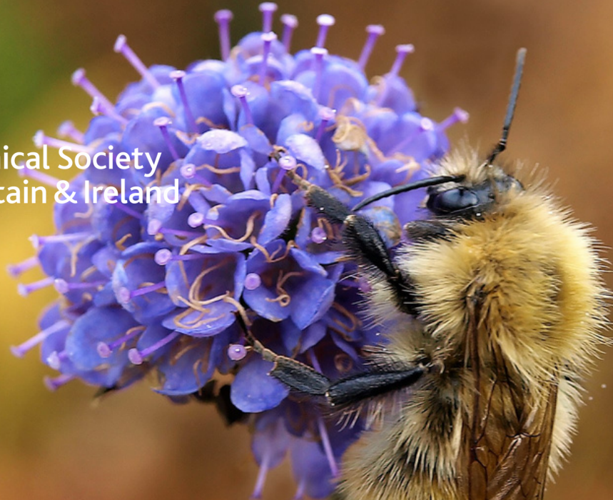
Devil's-bit Scabious ( Succisa pratensis) Gillies Hill