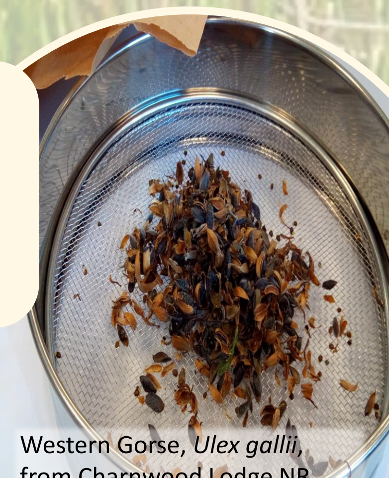
from Charnwood Lodge NR. Becoming scarce.

• The seeds need to be sorted from other plant debris or fruiting structures, often by crushing and sieving.