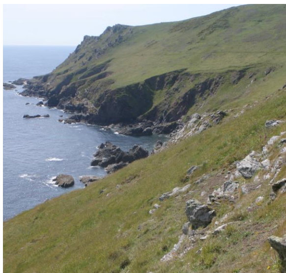
South-facing cliff slopes at Start Point, S. Devon, looking out to Peartree Point. The grassland in the foreground contains both L. angustissimus and L. subbiflorus

Lotus angustissimus is a few-flowered (usually 1 - 2 per head) annual with a covering of patent hairs. The small pale 'egg-yolk' yellow flowers are held on short pedicels, and the keel of the flower, as seen in the picture above, has an almost right-angled bend to it about halfway along the lower edge of the limb (Stace, 2010), as well as a short, straight-tipped beak (Kramina, 2006).