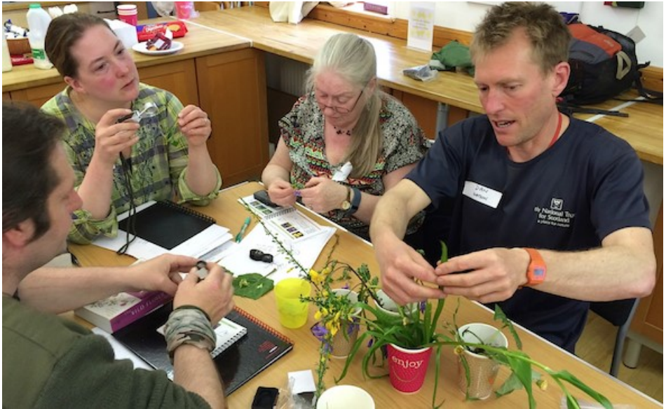
Above: Hands-on learning at Glencoe Plant Families workshop(See page 51)