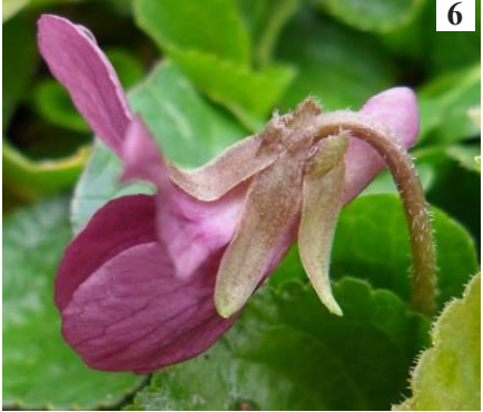
Front Cover Photo: Form of Viola odorata var. dumetorum (Sweet Violet) with purple splashing. On road bank north of East Aberthaw. 1-6: Other forms of Viola odorata . (see article, page 12).