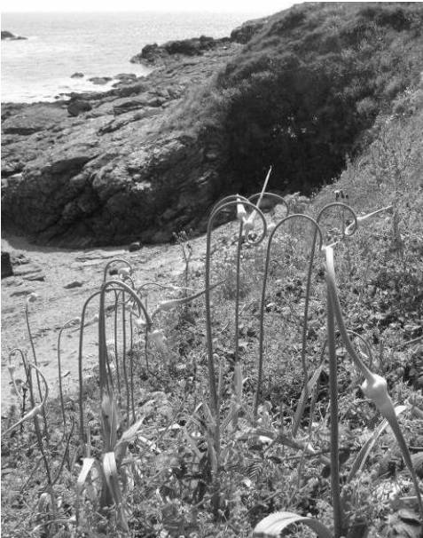
Image 5: Allium sativum var. ophioscorodon near Trearddur Bay, 2014.

may have been assisted by verge mowing scattering the bulbils. The only other Welsh location where A. sativum is known to grow wild is near the lifeboat station at Porth Dinllaen, Caernarvonshire (v.c.49). Wendy McCarthy advised that it has been known there since 1982, but had not noticed coiled flower stalks. Elsewhere, the BSBI database shows a pronounced cluster of tetrads with A. sativum on the west coast of Ireland in Co. Sligo (v.c.H28).