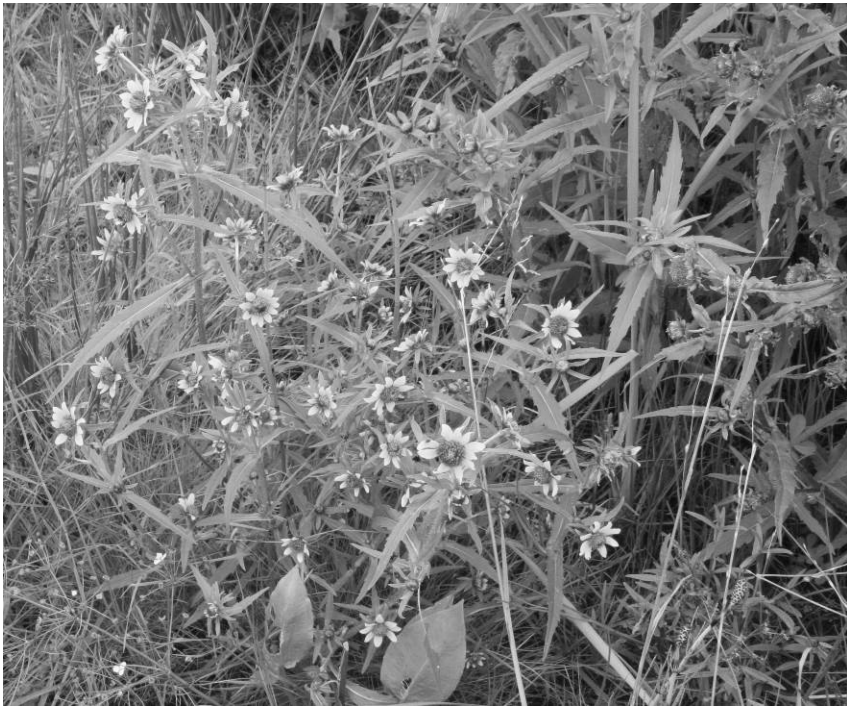
Image 4: Bidens cernua var. radiata (Nodding Bur-marigold).