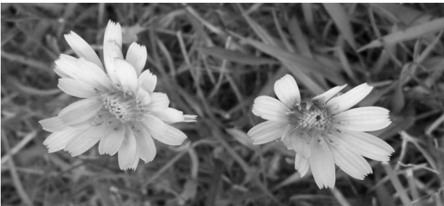
Image 3: Crepis rubra, an unusual non-native species in Cardiff Bay and a second record for Wales.