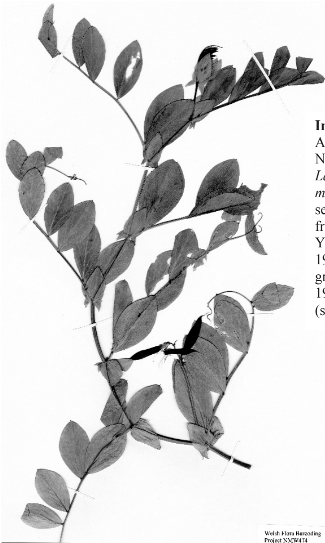
Image 6: Specimen in Amgueddfa Cymru-National Museum Wales of Lathyrus japonicus ssp. maritimus cultivated from seed originally collected from the strandline at Ynyslas, Cardiganshire in 1997 by A.O.Chater and grown by S.P.Chambers in 1999. (see article page 27).