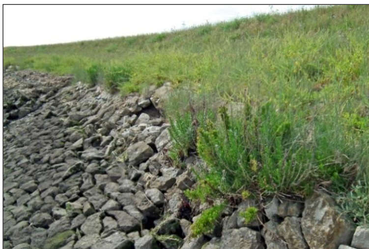
Grain, sea wall habitat. Photo by David Steere, 23 June 2015.

Unusually, it appears scattered on the East Kent chalk cliffs, a habitat which was not observed at all by the earlier botanists in Kent and which appears 2 to be a habitat type found in Kent and westwards in Great Britain from Purbeck. The earliest such sighting appears to have been by Francis Rose, who collected material in 1947 from chalk cliffs by the sea at East Wear Bay, Folkestone; and this may have been the location within the more exposed cliff zone subject to spraydrift with halophyte vegetation mentioned in Rose & Gehu (1964) 3 . We now have records from 2010 onwards, not only for the base of chalk cliffs at East Wear Bay, but also at Samphire Hoe, Ramsgate, Cliftonville, Westgate, Birchington and at the base of cliffs on the edge of a small salt marsh created by a break in sea defences at Kingsdown. Rodwell (2000) 4 points to the possibility of there being distinct ecotypes of Inula crithmoides in view of the striking difference in distribution of the saltmarsh and maritime cliff vegetation communities.