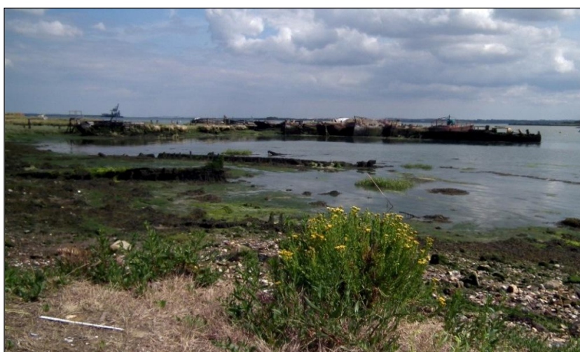
Hoo, shoreline habitat. Photo by David Steere, 31 July 2015.

tidemark habitat where it also grows extensively in the absence of saltmarsh. It has been recorded at the base of sea walls (on the maritime side); within the sea wall sloping stone batter; and at the crest, where land vegetation begins. Occasionally, it appears alongside saline ditches landward of the sea wall, and it has been recorded further inland near Faversham, by a sandy track over 400m inland from Oare Creek.