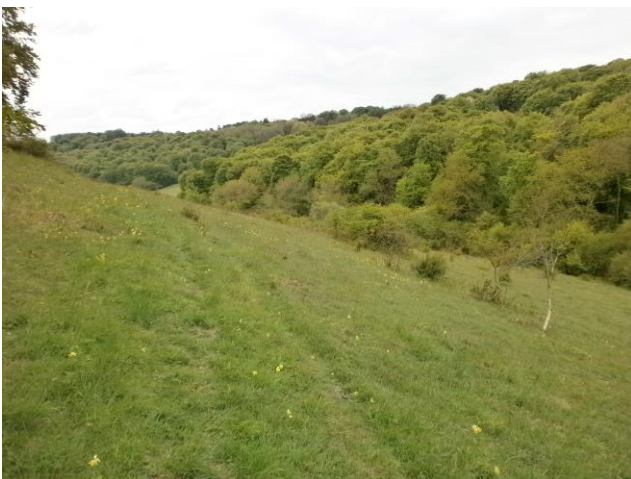
A private reserve in Buckinghamshire, one of just three extant native locations for Orchis militaris in the British Isles.

The inflorescence, borne on a stem 20–60 cm tall and often violet-tinged, is at first a fairly dense ovoid or cylindrical spike