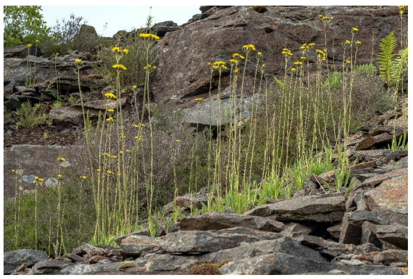
Pilosella praealta (Tall Mouse-ear-hawkweed) Railway track, Neath Port Talbot coastal path

+‡135/27.4.a. Pilosella praealta subsp. praealta. Cwmnantlleici Quarry (settlement tanks), SN733 071, Barry Stewart, 21st