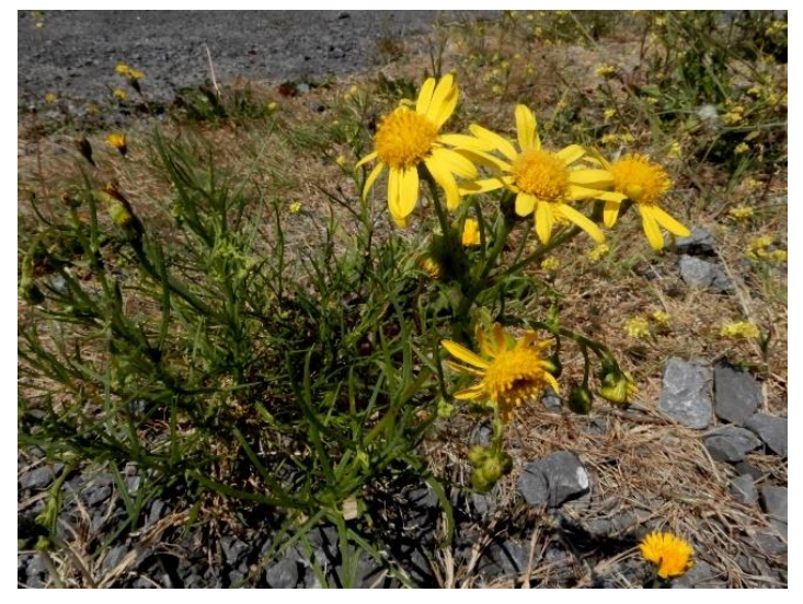
Senecio inaequidens, Narrow-leaved Ragwort, Creulys Gulddail

+‡135/62.03.© Senecio inaequidens (Narrowleaved Ragwort) (Creulys Gulddail) (right). Incredible Edible Community Project, Trallwm, Llanelli, SN5362 0033, R.D.Pryce &