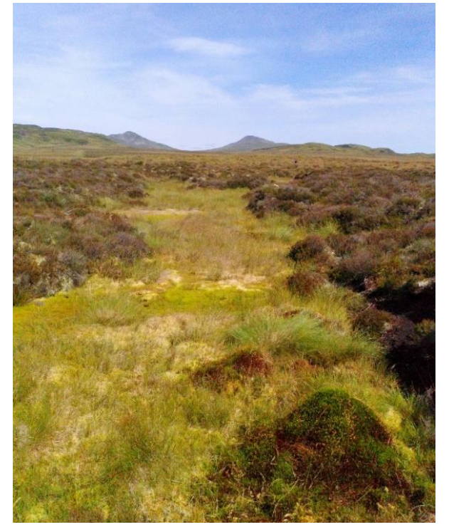
C. magellanicum (Tall Bog-sedge) habitat

The Afon Mawddach arises in a remote upland area above Waun y Griafolen approximately 5km northeast of Abergeirw, near Trawsfynyd d. This extensive area of deep peat has few ditches and a small area of peat hags but most of the wetland habitat appeared to be in favourable condition. With an average rainfall of 1200mm per annum the ground was very wet which made walking through the terrain hard work on a hot and humid day in July. Fortunately, the group was highly motivated to