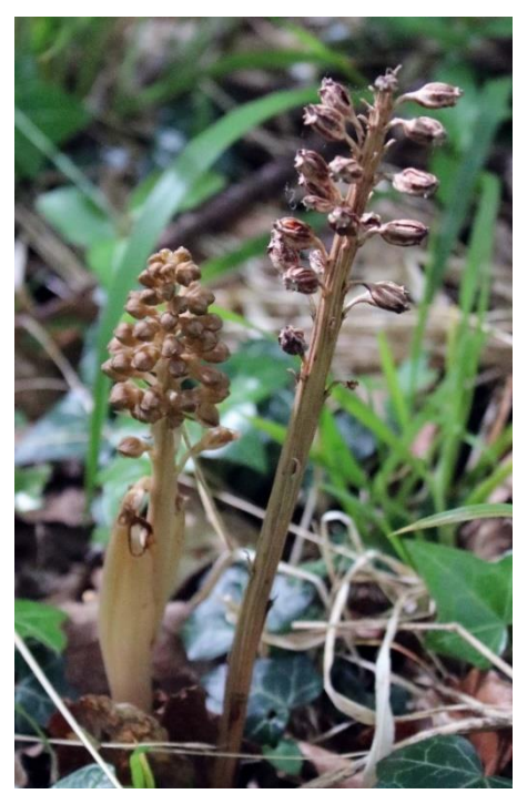
Photo 1: N. nidus-avis appearing to have produced inflorescences from the same rhizome in two consecutive years (2019 and 2020). On the left is the current year's spike and on the right the seedhead from the previous year

spikes in consecutive years from the same point on the rhizome (Photo 1, left).