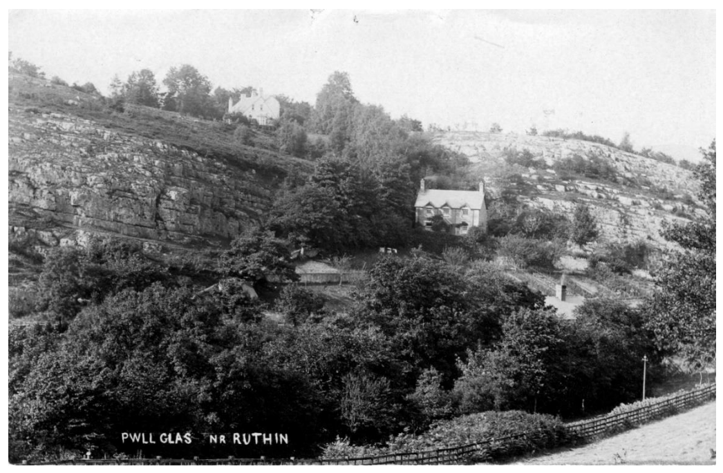
Photo 2: Image from a postcard of the house and surrounding land sent in 1907, depicting the area some time between 1882, when the house was built, and 1907. The area where N. nidus-avis inflorescences have been observed since 1987 (the herbaceous area in the top left above the escarpment) is almost devoid of trees.