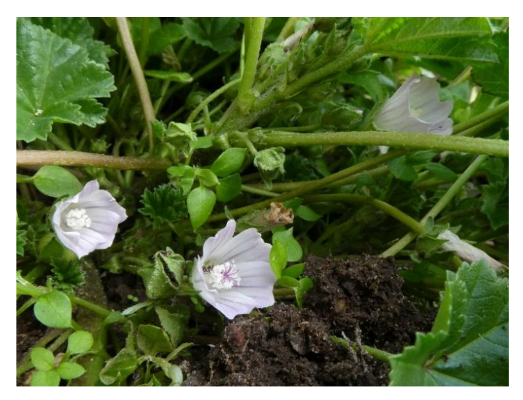
Malva neglecta, Dwarf Mallow, Corhocysen at The Green, Llansteffan, v.c.44

+053/1.7. Malva neglecta (Dwarf Mallow) (Corhocysen). The Green, Llansteffan, SN354 106, Andrew & Liz Stevens, 5th Jul 2023, >c.2000 plants along south-east facing slope of low, grass and paving-clad sea bank between SN 3539 1060