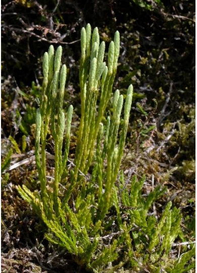
Diphasiatrum alpinum (Alpine Clubmoss) Glyncorrwg Forest track.