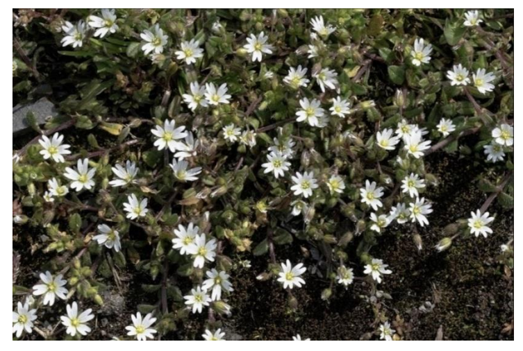
Cerastium pumilum, Dwarf Mouse-ear, Clust-y-llygoden Bitw at Margam Burrows, Glamorgan.