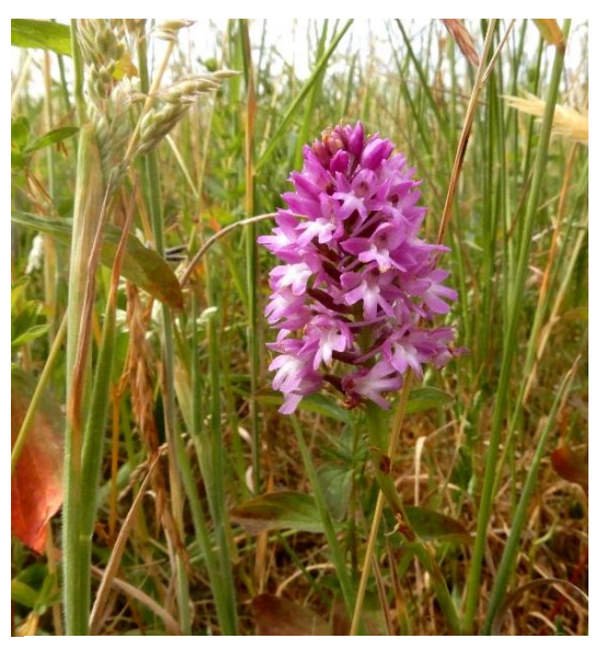
Anacamptis pyramidalis new to the site & hectad at Tumble Community Woodland, 2023.