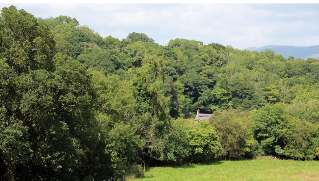
Photo 3: Shot of the same area as Photo 2 in 2023 from a slightly different angle. The visible building is the corner of the house shown in Photo 2 above. The extent to which the pasture, furze and escarpment has become wooded in the last 100+ years is obvious.

Photo 2: Image from a postcard of the house and surrounding land sent in 1907, depicting the area some time between 1882, when the house was built, and 1907. The area where N. nidus-avis inflorescences have been observed since 1987 (the herbaceous area in the top left above the escarpment) is almost devoid of trees.