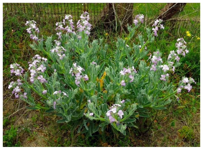
Matthiola sinuata (Sea Stock) on Baglan Dunes, Ragworm Farm

Cefn Cribwr Grasslands Special Area of Conservation was visited on the final day where, among many other notable species, was Scorzonera humilis (Viper's Grass) as well as Myrica gale (Bog Myrtle) and a large sward of Thelypteris palustris (Marsh Fern) with Juncus subnodulosus (Blunt-flowered Rush), Epipactis palustris (Marsh Helleborine) and Pedicularis palustris (Marsh Lousewort). Later that day a significant population of Epipactis phyllanthes (Green-flowered Helleborine) was found on the extensive, unrestored overburden mound, which is part of the worked-out Margam Opencast Mine.