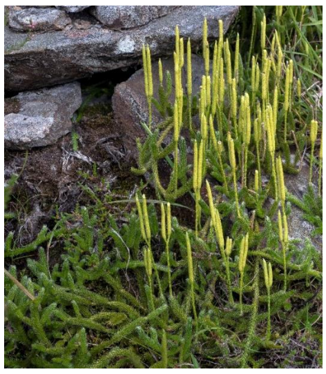
Lycopodium clavatum (Stag's-horn Clubmoss) Glyncorrwg Forest track.