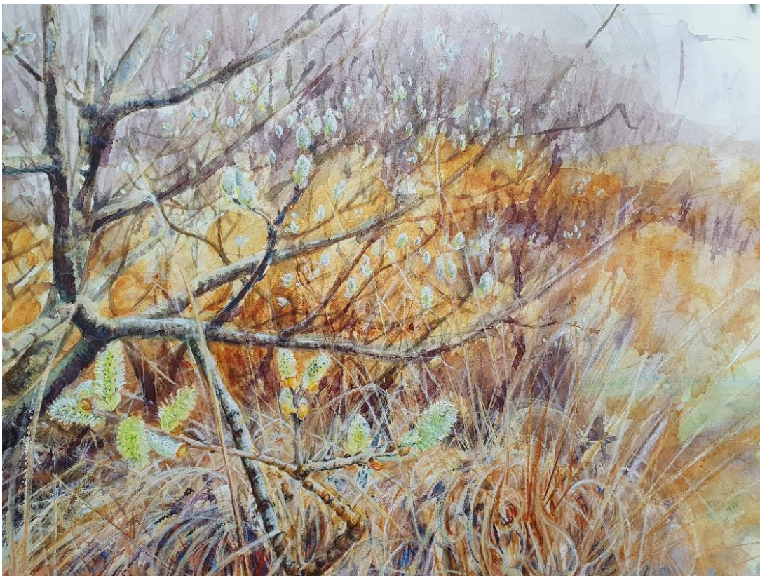
Grey willow/Helygen Iwyd/ Salix cinerea with Purple moor- grass/ Glaswellt y gweunydd/ Molinia caerulea and Bog myrtle/Helygen Fair/ Myrica gale , Cors Fochno, Ceredigion, March 2024. Mixed media on paper 26x36cm.