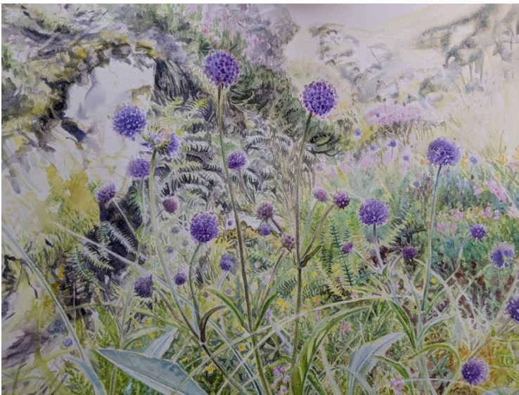
Devil's-bit scabious/Tamaid y cythraul/Succisa pratensis, Llyn Llygad Rheidol, Pumlumon, August 24. Mixed media on paper 26x36cm.