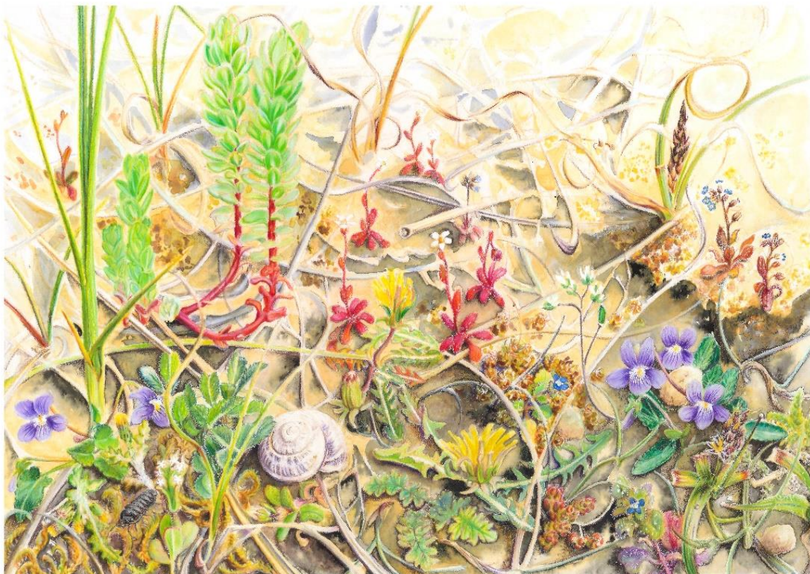
Ynyslas dune flora, Ceredigion, May 2021 Mixed media on paper. 21.5x29.5cm

Below are a few examples of the vegscapes idea. Titles and species names etc could be adapted to potential audience.