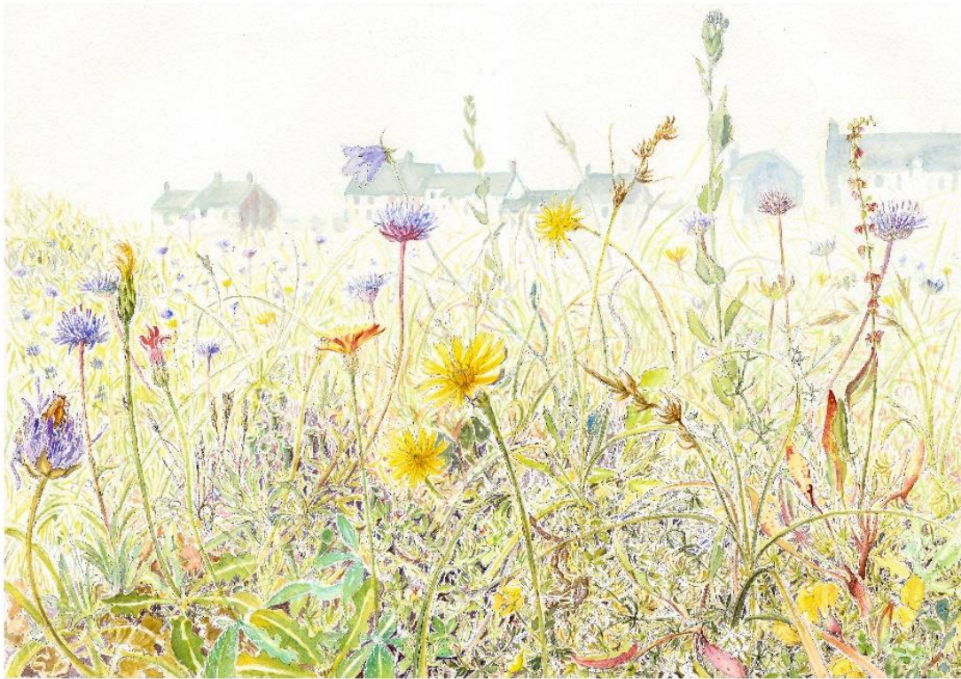
Morfa Borth, relic dune vegetation, Ceredigion, July 2020. Mixed media on paper, 21.5x29.5cm.