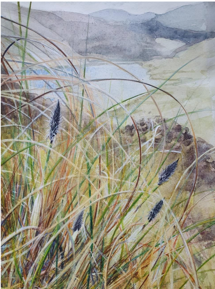
Hare's-tail cottongrass/Plu'r gweunydd unben/Eriophorum vaginatum Llyn Llygad Rheidol, Pumlumon, March 2024. Mixed media on paper, 26x18cm