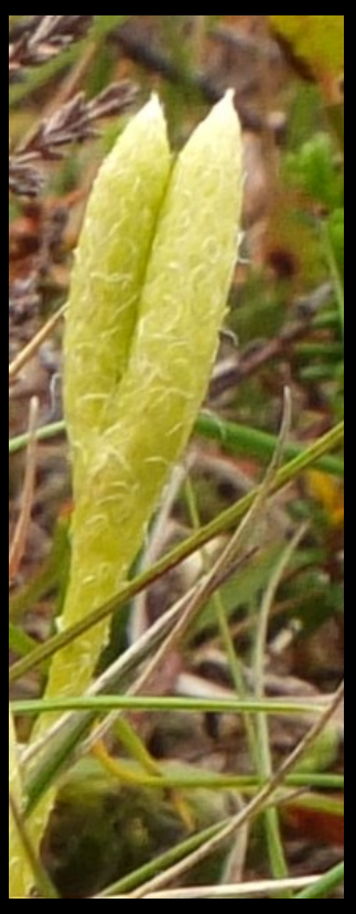
Lycopodium lagopus A' Mharconaich (E. of) vc96 - 820m AOD - 16/8/2015