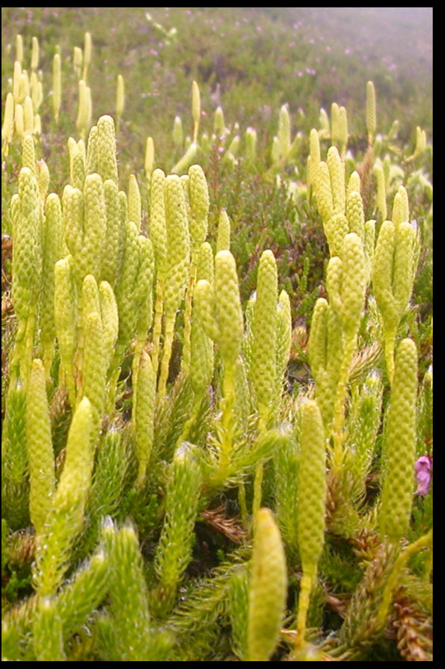
Ian Strachan (L. lagopus vc97)