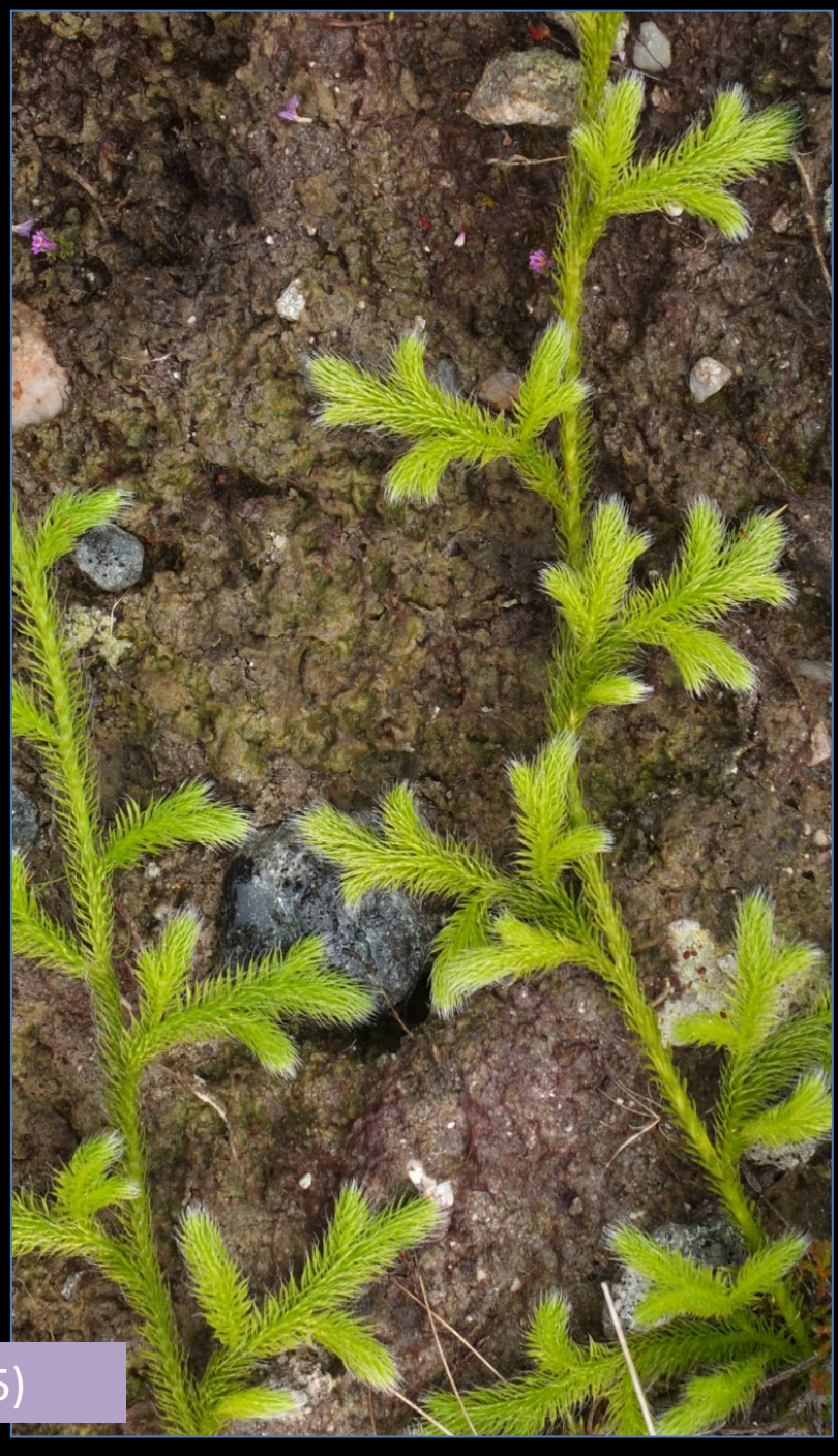
Typical appearance of Lycopodium clavatum (vc95)