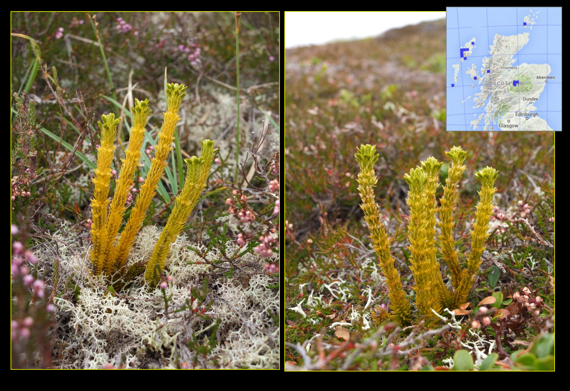
Huperzia selago subsp. arctica. Yellowish colour, erect leaves. May be two rows of gemmifers per annual growth zone. Under-recorded.