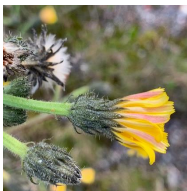
Picris hieracioides subsp. hieracioides (Hawkweed Oxtongue)