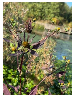
Bidens frondosa (Beggarticks)