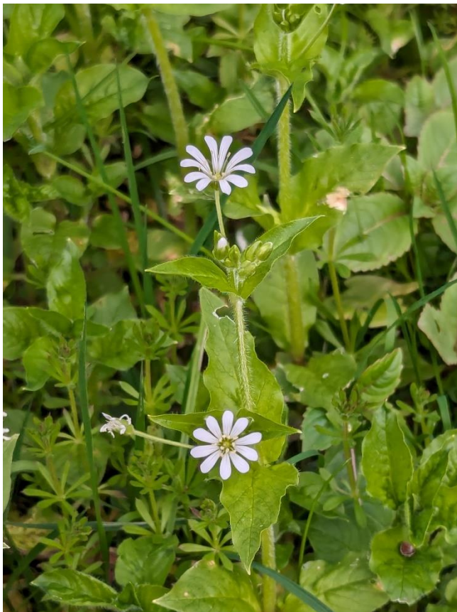
Wood Stichwort Brydekirk April 2024

Once we left the houses the river habitat and woodland becomes more natural and the deeply cleft petals of Wood Stichwort Stellaria nemorum were soon seen on the riverbank.