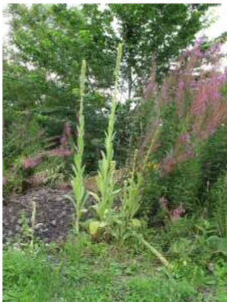
Great Mullein Verbascum thapsus

The works to open up a new industrial site at Burnfoot had released some buried seed that seemed to relate to the old railway with Smith's Pepperwort Lepidium heterophyllum and a good colony of an Eyebright, either Euphrasia nemorosa or one of its hybrids. A sown wildflower mix had introduced a robust upright