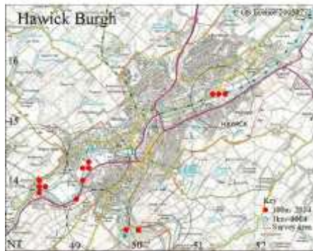
Campanula latifolia (Giant Bellflower)

The banks are often built up from sandy alluvium but vary in their moisture retention. Open stretches of the vegetation are largely made up of a few coarse grasses, False Oat-grass Arrhenatherum elatius , and Cock's-foot Dactylis glomerata , with Tufted Hair-grass Deschampsia and Yorkshire-fog Holcus lanatus cespitosus together with Common Nettle Urtica dioica in varying abundance. Where they dominate, these species crowd out all but the most robust herbs. Nevertheless the wide range of microhabitats allows a very diverse flora. Tuberous Comfrey Symphytum tuberosum (see map, selectively recorded) is plentiful while Russian Comfrey S. x uplandicum (see map, selectively recorded) is more local. Rev J Duncan knew the former as a Roxburghshire rarity in the 1860's, though not from the Teviot, and did