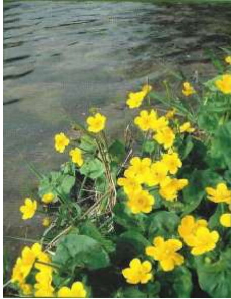
Marsh Marigold Caltha palustris

At the junction between the A7 trunk road and the road to Lilliesleaf there is a small mire. This was a more significant feature until relatively recent drainage works and I remember a good show of Marsh Marigold Caltha palustris there in the spring, but this plant is no longer present (though it is still found by the river). There are several rush species including Compact Rush Juncus conglomeratus , Sharp-flowered Rush J. acutiflorus and its hybrid with Jointed Rush, J. x surrejanus . The sedges are Lesser Pond-sedge Carex acutiformis , Brown Sedge C. disticha and Oval Sedge C. leporina . To enliven this assemblage there is a colony of Common Spotted-orchid Dactylorhiza fuchsii at the margin of the mire.