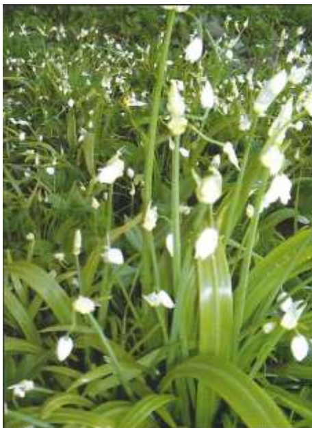
Few-flowered Garlic Allium paradoxum

it produces yellowish bulbils in the flower heads and its bulbs also divide freely below ground. These are spread in the same way as for snowdrops. Few-flowered Garlic is now abundant along the Teviot and must soon become