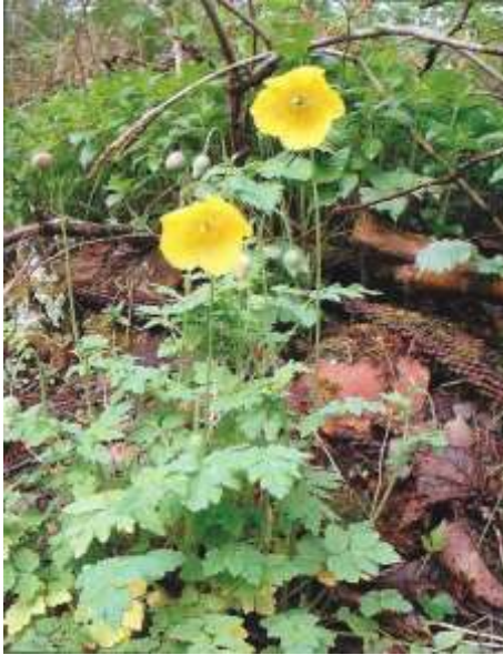
Welsh Poppy Mecanopsis cambrica

of a history as acid grassland as of former scrubby woodland. The trees include ash and elm with Norway Maple, Horse Chestnut, Silver Birch and Lawson's Cypress Chamaecyparis lawsoniana . Honeysuckle is present with Cherry Laurel Prunus laurocerasus and Rhododendron Rhododendron ponticum as the most prominent shrubs. The ground layer has only a very little Wood Anemone Anemone nemorosa which may be a grassland relict as may be Pignut Conopodium majus while Three-veined Sandwort Moehringia trinervia ,