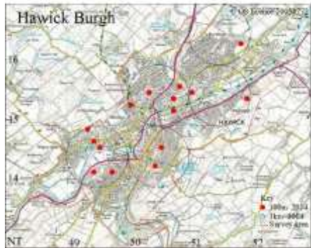
Prunus laurocerasus (Cherry Laurel)

The other must-have was Wellingtonia Sequoiadendron giganteum , promoted as the largest tree in the world. Hawick has a splendid collection of these and they have still a long way to go before they reach their full height. Most are in the large gardens in Wilton and Sunnyhill but there is one in Wilton Lodge Park and two at Lynnwood. At the site of the old Wilton Manse above the Fire Station they are accompanied by Coastal Redwood Sequoia sempervirens , which has grown almost as well. Both these species are native in a humid climate on the western seaboard of North America and it has been surprising how well they have adapted to the less-moist climate of eastern Scotland.