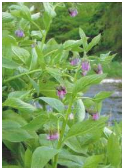
Russian Comfrey Symphytum x uplandicum

not record the latter. Modest patches of Common Michaelmas-daisy Aster novi-belgii were found by Wilton Lodge Park and below Mansfield, Fuchsia Fuchsia magellanica on the north bank just upstream of the Cauld, Meadow Crane's-bill Geranium pratense is widespread while Wood Crane's-bill G. sylvaticum is found by Wilton Lodge Park where there is also a patch of the pink-flowered Druce's Crane's-bill G. x oxonianum , which is a popular garden plant. The St John's-worts are well represented. Hairy St John's-wort Hypericum hirsutum is quite scarce while Perforate St John's-wort H. perforatum is frequent on dry banks with Hybrid St John's-wort H. x desetangsii a little less frequent in marginally more shady habitats,