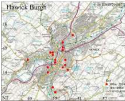
Asplenium ruta-muraria (Wall-rue)