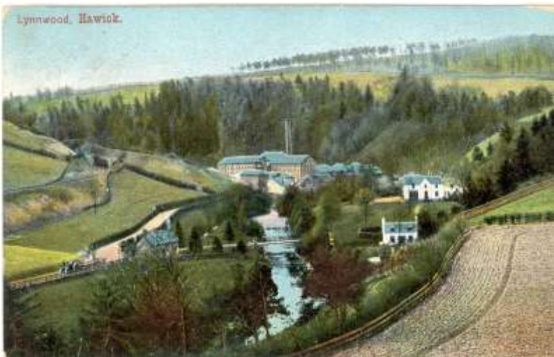
Lynnwood Mill and Whitlaw Wood with conifers c. 1905

Whitlaw Wood together with the scaurs along the Slitrig to the dean at Lynnwood are much the most natural wildlife habitat in Hawick Burgh. Only half the wood is in the Burgh, but my survey in 2014 has covered the whole, not least as it is now recognised as a Site of Special Scientific Interest. Part is a reserve of the Scottish Wildlife Trust.