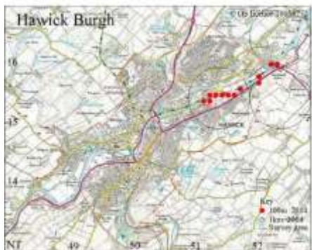
Allium carinatum (Keeled Garlic)

flowering stem has a round head with a mixture of purplish flowers and bulbils in mid-summer. It seems only to have colonised the Teviot in the last thirty years. The first record by the Teviot was in 1992 but it had been known on the old railway since 1952. I have been amazed to find that it is present in every 100m stretch of the Teviot through the town. I have traced it upstream and find that it first appears at Newmill on Teviot. Downstream it continues to the Tweed and on to Berwick. It