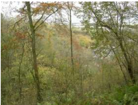
Regrowth following beech felling 2014

them are multi-trunked. Most appear to be Pedunculate Oak but some are close to Sessile Oak Q. petraea , though they are also hybrids between the two species and these may include some of the trees that look like Pedunculate Oak. Further hybrid oaks occur in a few places on the lower slopes and some show evidence of coppicing. The species that come away again from stumps and suckers after felling, like hazel, gean, alder, bird cherry, blackthorn and guelder-rose, may have