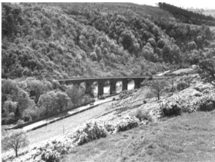
Whitlaw Wood and Six-arch Bridge from Hardie's Hill c. 1960

been felled frequently, with spruce planted around 1840 when it was very much in fashion. The next felling appears to have been during the First World War, quite possibly to provide timber for Stobs Camp. Labour to replant would not have been available during the war, so it was left to regenerate on its own, a happy accident that has left us with a much richer resource than could have been expected. Not all the regeneration was of native trees, there was Beech Fagus sylvatica and Sycamore Acer pseudoplatanus as well. Much of the beech and sycamore was felled in 2004 by the Scottish Wildlife Trust as their heavy shade was detrimental to the ground flora.