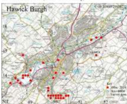
Ranunculus auricomus (Goldilocks Buttercup)

Two attractive clumps of Green Hellebore Helleborus viride grow near the Slitrig, where they have been since 1975 or earlier. This is an old garden introduction that is now very rarely cultivated. Lungwort Pulmonaria officinalis has naturalised nearby with Early Goldenrod Solidago gigantea a little further downstream. Welsh Poppy Mecanopsis cambrica is occasional as a naturalised garden escape.