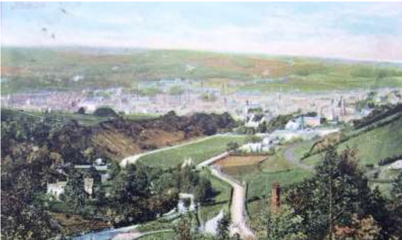
Hawick from Lynnwood c. 1900, with cultivated land on the haugh by the Slitrig and by The Motte, with recently felled woodland between

It may come as a surprise to some that quite the largest landscape change in the last two centuries has been the loss of arable fields. Today there are no arable fields within the strict boundary of the Burgh, though one small arable field at Gala Law falls just within the survey area. In the early nineteenth century there