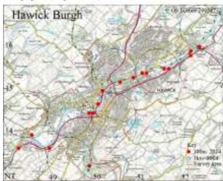
Salix purpurea (Purple Willow)

fine planted specimen of White Willow Salix alba just upstream of the Cauld. Several Weeping Willow S. x sepulcralis nothovar. chrysocoma have been planted below Mansfield and there are other hybrid willow introductions in several places. Two poplars have been planted, Western Balsam-poplar Populus trichocarpa and Hybrid Black-poplar P. x canadensis , while Alder Alnus glutinosa is quite frequent and sometimes self-sown.