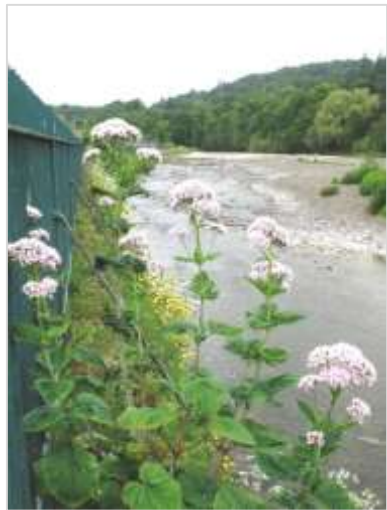
Pyrenean Valerian Valeriana pyrenaica

marshes Chrysoplenium alternifolium in shade below Weensland. Surprisingly, Yellow Iris Iris pseudacorus is known only on the Slitrig near St Cuthbert's Church. Spear Mint Mentha spicata and Peppermint M. x piperta grow in mud, Amphibious Bistort Persicaria amphibia also grows in mud from where it sometimes extends onto the water, while Common Valerian Valeriana officinalis favours seepages.