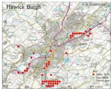
Anemone nemorosa (Wood Anemone)

The ground flora is also diverse and includes some scarce species. The wood is a fine sight in the spring when an abundance of Wood Anemone Anemone nemorosa (see map, intensively recorded) is in flower on the drier banks. This is a clonal species forming large vegetative patches, some of which are likely to date back hundreds of years. The wet gullies are carpeted with Ramsons Allium ursinum and in between there is Dog's Mercury Mercurialis perennis and some Primrose Primula vulgaris . The latter, though widespread, is not particularly plentiful. Other common species present are Red Campion Silene dioica , Greater Stitchwort Stellaria holostea and Common Violet Viola riviniana .