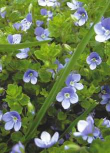
Slender Speedwell Veronica filiformis

The Walled Garden is wonderfully maintained, but, despite the best endeavours of the gardeners, a few exotic weeds survive precariously. One of the most interesting is American Speedwell Veronica peregrina , a small, inconspicuous upright annual found in cracks in the path by the pond and also in a bed to the east of the entrance. It has a penchant for walled gardens, such as that at Newton Don near Kelso where it has been known since 1873. A much more recent incomer in small quantity is New Zealand Bitter-cress Cardamine corymbosa which has been spread around in the last two decades by rock garden enthusiasts, as it colonises the gritty soil used in plant pots. Its white flowers can form an attractive carpet in spring but the later flowering is on taller stems that look