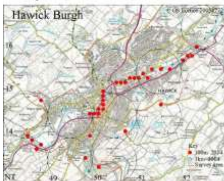
Geranium pratense (Meadow Crane's-bill)