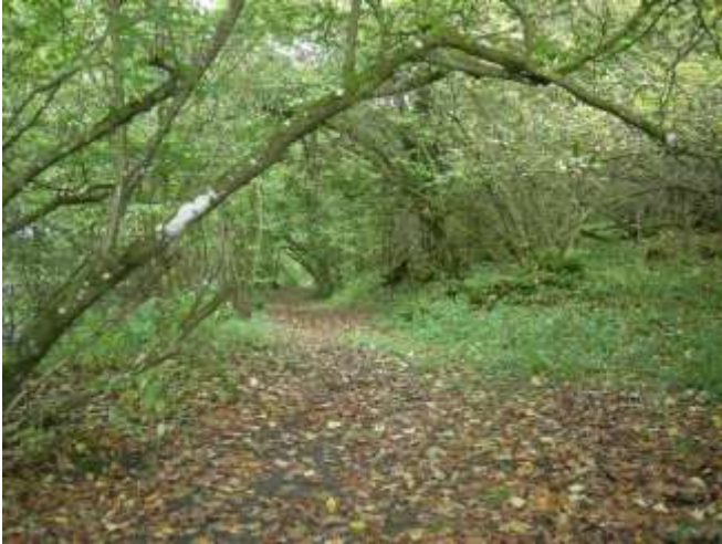
Scrub overhanging old railway ballast 2014

Restharrow Ononis repens , Wild Marjoram Origanum vulgare and Wood Sage Teucrium scorodonia , but Shasta Daisy Leucanthemum x superbum has somehow been introduced and has naturalised. Here I found just a single plant of Kidney Vetch Anthyllis vulneraria which used to be plentiful on this stretch of the old railway and supported a colony of the Small Blue butterfly Cupido minimus .