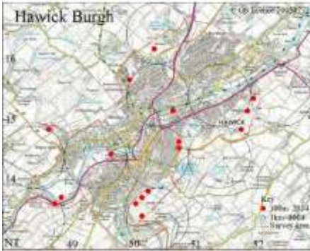
Galium verum (Lady's Bedstraw)

Across the Easter Braid Road there is a small paddock currently grazed by horses. This has a very much richer flora of which the highlight is Common Rockrose Helianthemum nummularium in fair quantity. Here there is no Heather but there is a little Blaeberry Vaccinium myrtillus . There are some delicate grasses. Silver Hair-grass Aira caryophyllea , Early Hair-grass A. praecox , Meadow oat-grass Avenula pratensis and Yellow Oat-grass Trisetum