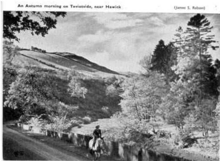
A7 trunk road through Pipewellheugh 1950's