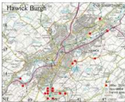
Geranium sylvaticum (Wood Crane's-bill)

Geum rivale and rushes. There is a good showing of roses with Soft Downy-rose Rosa mollis the most prominent. The central part has Cuckooflower Cardamine pratensis , including some double-flowered plants, and two species of Lady's-mantle Alchemilla filicaulis subsp. vestita and A. xanthochlora . There is a large population of Common Spotted-orchid Dactylorhiza fuchsii and a little Northern Marsh-orchid D. purpurella with their hybrid.