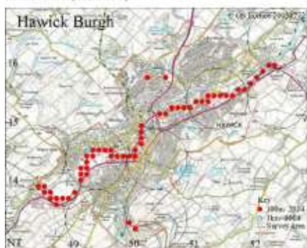
Allium vineale (Wild Onion)

is still on the old railway at Hardie's Hill but has now reached the Slitrig at the site of the former Six-arch Bridge. Keeled Garlic A. carinatum (see map, intensively recorded) has channelled leaves with a keel as the name suggests. It flowers later than Wild Onion and is more colourful, as there is a higher proportion of crimson flowers among the bulbils. It was first recorded by the Teviot below Mansfield in 1951. It is still there on both sides of the river and is present in every 100m stretch to the Burgh boundary. Further downstream it is local, being especially