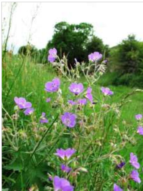
Meadow Crane's-bill Geranium pratense