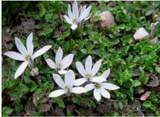
Lawn Lobelia Pratia angulata

The banks behind the haugh grassland upstream of the Museum have the remnants of a woodland and grassland flora. Goldilocks Buttercup Ranunculus auricomus is surprisingly frequent and there is a little Bulbous Buttercup R. bulbosus . Heath Speedwell Veronica officinalis is present in a form that has almost white flowers with violet veins.