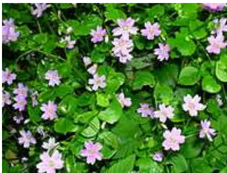
Pink Purslane Claytonia sibirica

All of Wilton Dean has been included in the survey area, though the upper part is outwith the Burgh boundary. The lower part of the dean, just above the park, is mainly beech and the ground flora is sparse. Then come the houses of Wilton village. The upper part of the dean has many planted trees but it has a natural feel to it and there is native ash, elm, gean and hazel with Downy Birch Betula pubescens and naturalised Norway Maple Acer platanoides . Hornbeam Carpinus betulus has been planted near the houses. The ground flora includes Wood Anemone Anemone nemorosa , Woodruff Galium odoratum , Honeysuckle Lonicera periclymenum , Dog's Mercury Mercurialis perennis , Primrose Primula vulgaris , Goldilocks Buttercup Ranunculus auricomus , Sanicle Sanicula europaea and Greater Stitchwort Stellaria holostea . There is a bank at the very top of the dean with Rockrose Helianthemum nummularium . Amongst the ferns present in some quantity are Hart's-tongue Fern Asplenium scolopendrium and Hard Shield-fern Polystichum aculeatum with a little of the latter's hybrid with Soft Shield-fern P. x bicknellii . Woodland grasses include Bearded Couch Elymus caninus and Wood Meadow-grass Poa nemoralis .