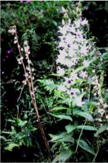
Giant Bellflower Campanula latifolia

damp grassland, is only known just upstream of the Cauld by the High School.