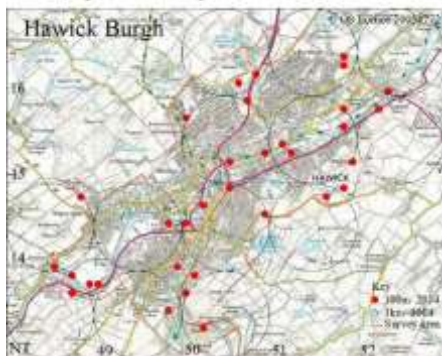
Centaurea nigra (Common Knapweed)

map, selectively recorded), Meadow Crane's-bill Geranium pratense , Field Scabious Knautia arvensis , Burnet-saxifrage Pimpinella saxifraga , Barren Strawberry Potentilla sterilis and Zig-zag Clover Trifolium medium . These are accompanied by an unidentified dog-rose and, rather surprisingly, by Imperforate St John's-wort Hypericum maculatum , which is something of a speciality of the town.