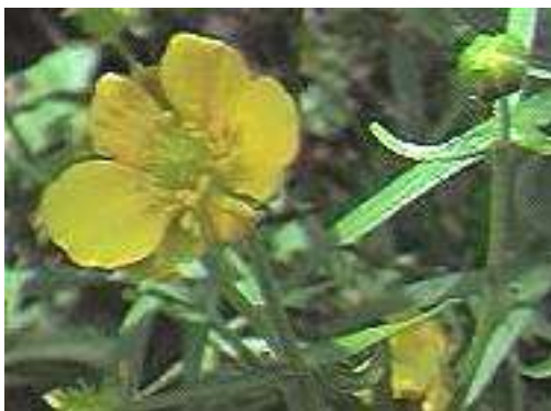
Goldilocks Buttercup Ranunculus auricomus It often has imperfect petals

The brambles are very remarkable. In addition to varieties of the Common Bramble there are two colonies of the locally scarce Stone Bramble Rubus saxatilis under hazel and oak. This is a species normally found in hill cleughs. In a sunny position by the old bridge abutment there is a colony of Dewberry Rubus caesius . This species is more typical of the coast and south-facing banks by the lower Tweed.