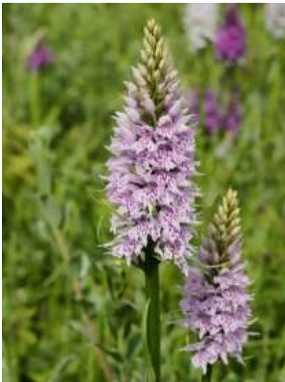
Common Spotted-orchid Dactylorhiza fuchsii