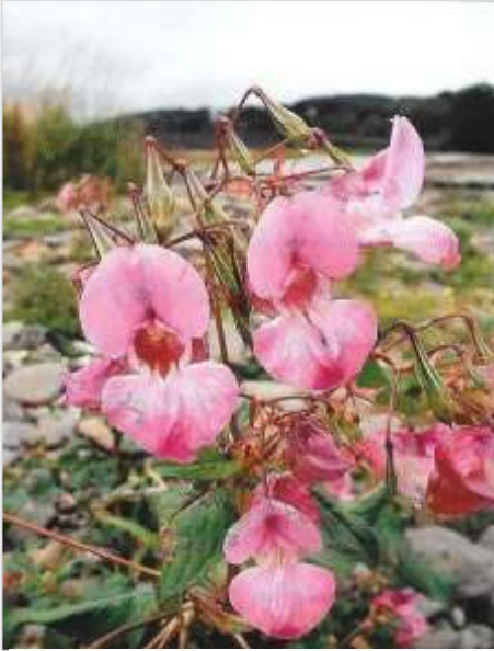
Indian Balsam Impatiens glandulifera

dominant where there is much alluvium and is sometimes replaced by dense patches of Lesser Pond-sedge Carex acutiformis , while Bottle Sedge Carex rostrata was only found in small quantity just upstream of the Cauld.