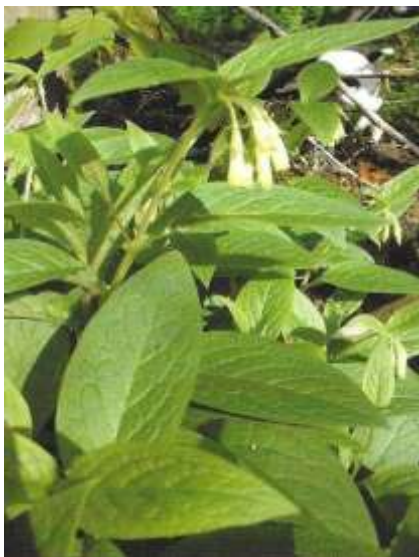
Tuberos Comfrey Symphytum tuberosum