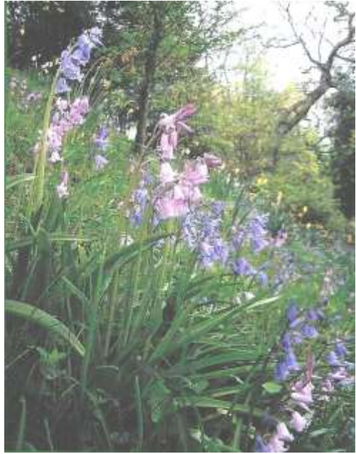
Garden Bluebell Hyacinthoides x massartiana

The grassland contains elements of former meadow and the more heathy grassland found in the fields above the town. Pignut Conopodium majus and Bulbous Buttercup Ranunculus bulbosus are relicts of the former while Heath Bedstraw Galium saxatile is evidence of the latter. The wooded bank includes native woodland species like Wood Meadow-grass Poa nemoralis , Goldilocks Buttercup Ranunculus auricomus and Common Figwort Scrophularia nodosa along with introductions including White Woodrush Luzula luzuloides and London-pride Saxifraga x urbium , both typical Victorian plantings.