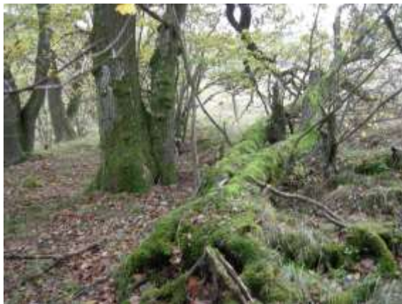
Multi-trunked oaks in Whitlaw Wood 2014

Norway Maple Acer platanoides , Scots Pine Pinus sylvestris , Barberry Berberis vulgaris and Red-berried Elder Sambucus racemosa , the latter bird-sown alongside the native elder S. nigra which is black-berried. SWT have been supplied with some Grey Alder Alnus incana , presumably when they had ordered Common Alder A. glutinosa , and this has grown strongly where it has been planted in wet places on the upper slopes. Snowberry Symphoricarpos albus has been dumped at the top of the scaurs and has naturalised there.