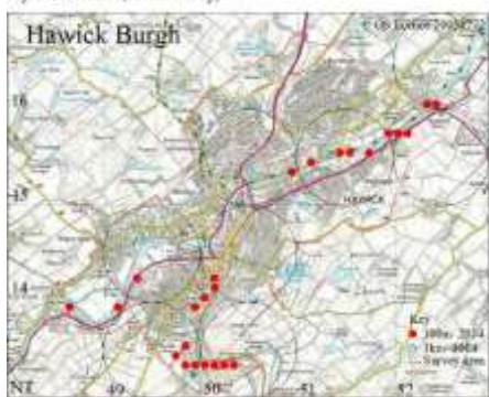
Myrrhis odorata (Sweet Cicely)

when sugar and honey were luxuries. It is unusually plentiful by both the Teviot and Slitrig, favouring sandy alluvium on the riverbanks. There are a number of less benign introductions. The most notorious is Giant Hogweed Heracleum mantegazzianum (see map, intensively recorded) which was getting a strong hold on the riversides before control measures were begun a few years ago. As it has a persistent seed bank, it is still present in small numbers all along the Teviot, but not the Slitrig, though no plants were found that had been allowed to seed. One plant that was in seed turned out to be the rare hybrid with Common Hogweed H. sphondylium . Japanese Knotweed Fallopia japonica has an even more evil reputation as its rhizomes can penetrate under paving and buildings causing serious damage. It does not spread so aggressively but is present at Lynnwood on the Slitrig and Weensland on the Teviot. Indian Balsam Impatiens glandulifera (see map, intensively recorded) also has a bad press. It is now present by the Teviot all the way from Parkdail to Bucklands but is not