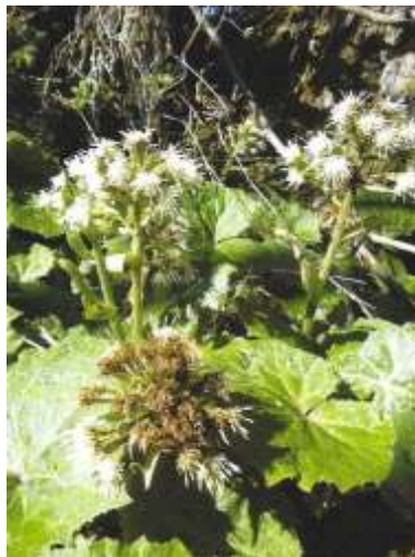
White Butterbur Petasites albus

The Butterburs are also interesting. Common Butterbur Petasites hybridus comes in two forms, a mainly male form and a mainly female form. The root was used medicinally, the huge leaves as a wrapping material and the male flowers as an early nectar source for bee keeping. Almost all the