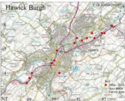
Symphytum tuberosum (Tuberous Comfrey)

The banks are often built up from sandy alluvium but vary in their moisture retention. Open stretches of the vegetation are largely made up of a few coarse grasses, False Oat-grass Arrhenatherum elatius , and Cock's-foot Dactylis glomerata , with Tufted Hair-grass Deschampsia and Yorkshire-fog Holcus lanatus cespitosus together with Common Nettle Urtica dioica in varying abundance. Where they dominate, these species crowd out all but the most robust herbs. Nevertheless the wide range of microhabitats allows a very diverse flora. Tuberous Comfrey Symphytum tuberosum (see map, selectively recorded) is plentiful while Russian Comfrey S. x uplandicum (see map, selectively recorded) is more local. Rev J Duncan knew the former as a Roxburghshire rarity in the 1860's, though not from the Teviot, and did