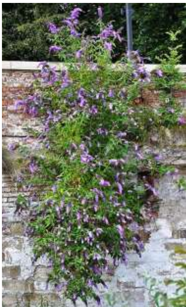
Buddleja Buddleja davidii

but I have more often seen it in the Sandbed. Common Cornsalad Valerianella locusta is quite plentiful at the riverside pavement's-edge in Mansfield and in more modest quantity in the Wester Braid Road close to the 'fields near Wellogate' where Sir James A H Murray knew it in the 1860's as an arable weed, a habitat in which it is no longer found in the Scottish Borders. American Speedwell Veronica peregrina has a strong colony in Dickson Street near Wilton Church while Yellow-juiced Poppy Papaver lecoqii was found unexpectedly by a roadside lamppost in the Stirches housing estate.