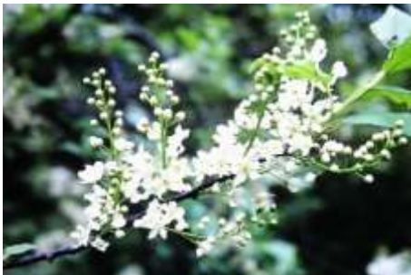
Bird Cherry Prunus padus

1970's but have now recovered to the point when their yellow immature fruits make a landscape feature in late April, just before the leaves unfurl. Bird Cherry