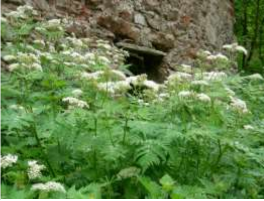
Sweet Cicely Myrrhis odorata

of the wood and can be expected to colonise extensively in the coming decade to the detriment of the native flora in springtime.