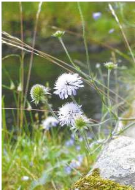
Field Scabious Knautia arvensis

Martagon Lily Lilium martagon was found below Mansfield while a self-sown plant of Wilson's Honeysuckle Lonicera nitida was found on a river bank in the Wilton Lodge Park. Marjoram Origanum vulgare has several colonies below Mansfield where Green Alkanet Pentaglottis sempervirens is also found. Bistort