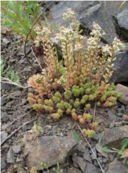
White Stonecrop Sedum album

Wall Cotoneaster Cotoneaster horizontalis and two stonecrops: White Stonecrop Sedum album and Reflexed Stonecrop S. rupestre . Both are introductions, but are self-sown at this site. On the verge at the foot of the rock is a colony of Field Scabious Knautia arvensis , with Pink Purslane Claytonia sibirica not far away.