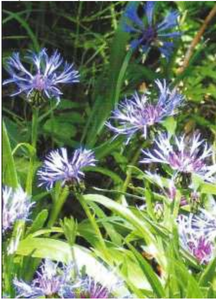
Perennial Cornflower Centaurea montana

A fascination of an urban area is the considerable number of small pockets of grassland that harbour species of interest, many of them introductions. These include road verges and bankings. A damp paddock next to Whitlaw Wood has been poached by horses allowing a colony of Red Bartsia Odontites vernus to flourish. Common Blue-sow-thistle Cicerbita macrophylla is a throw-out found below the houses across the Slitrig from Whitlaw Wood with Mawson's Lungwort Pulmonaria 'Mawson's Blue' nearby. Sweet-briar Rosa rubiginosa is only known by a lane to fields near Wester Braid Road near where Hedge