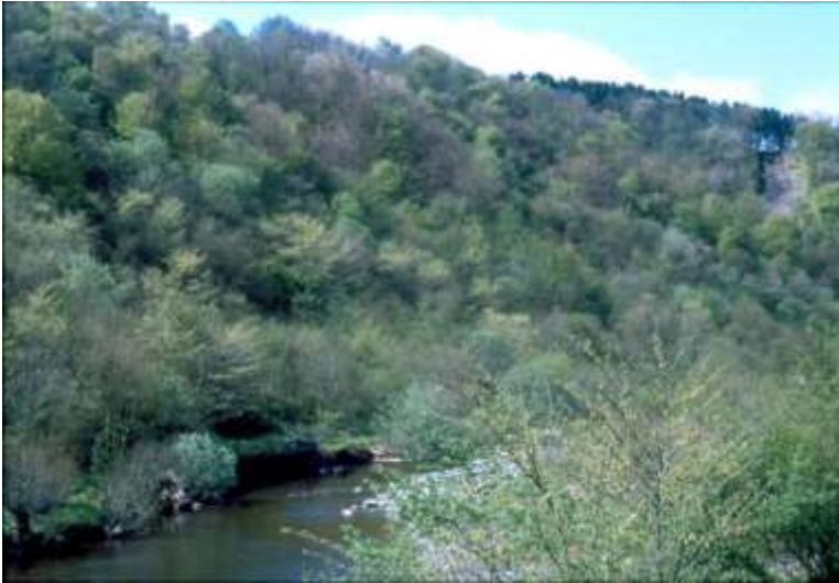
Whitlaw Wood in April 1989 with willows and gean in flower

than Downy Birch B. pubescens which is more widespread in the area as a native species, and birch has colonised the former railway cutting through the wood as a dense strip of young trees that stands out clearly when viewed from Hardie's Hill. The Silver Birch may be native, but it could have naturalised from planted trees in the town. The elms were almost eliminated by Dutch elm disease in the