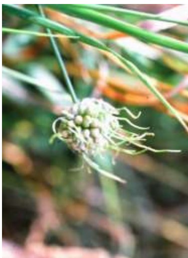
Wild Onion Allium vineale

flowering stem has a round head with a mixture of purplish flowers and bulbils in mid-summer. It seems only to have colonised the Teviot in the last thirty years. The first record by the Teviot was in 1992 but it had been known on the old railway since 1952. I have been amazed to find that it is present in every 100m stretch of the Teviot through the town. I have traced it upstream and find that it first appears at Newmill on Teviot. Downstream it continues to the Tweed and on to Berwick. It