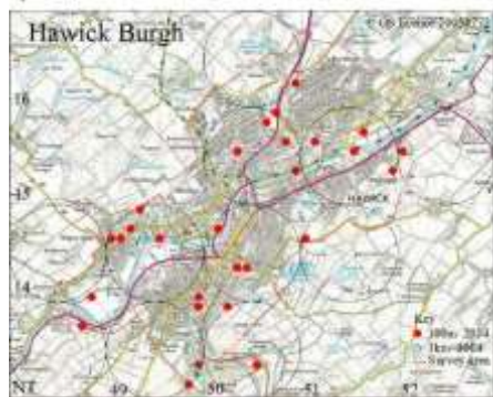
Hyacynthoides x massartiana (Garden Bluebell)

walls has Wall-rue Asplenium ruta-muraria and there is even less Maidenhair Spleenwort A. trichomanes subsp. quadrivalens . Hard Fern Blechnum spicant is a rather surprising colonist in two places on the wooded bank. It has not been found anywhere else in the town.