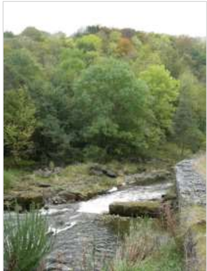
Cauld at site of the Six-arch Bridge

Common Valerian Valeriana officinalis and Wood Speedwell Veronica montana . There are scattered plants of Giant Bellflower Campanula latifolia at the river's edge, especially fine near the site of the former Six-arch Bridge, while a few plants of Bird's-nest Orchid Neottia nidus-avis still turn up in scattered locations in the wood. This orchid was much more plentiful under the hazels in the 1970's. There is a little Common Spotted-orchid Dactylorhiza fuchsii and Northern Marsh-orchid D. purpurella . There are some spectacular patches of Wood Vetch Vicia sylvatica , one of the glories of the wood. It thrives best in glades. It was formerly plentiful along the railway embankment in the wood, but this has now been densely colonised by birch, shading out much of the vetch. The felling of beech and sycamore opened up glades where the best patches are now found, but these are now colonised by ash and the vetch is beginning to suffer. The old railway was