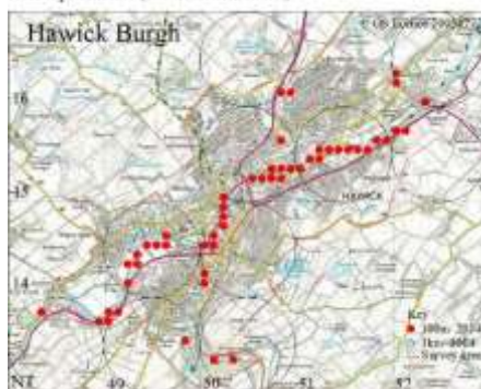
Allium paradoxum (Few-flowered Garlic)

dominant there. I had thought it absent from the Slitrig but it has reached Whitlaw Wood in the last few years and is set to spread into the town. An open question is whether Few-flowered Garlic will out-compete Ramsons: I consider the jury to be still out on that one. The carpets of shining green leaves are so noticeable before the flowers open that I once dubbed Few-flowered Garlic 'Plastic-grass'. As yet it is relatively scarce in gardens, but this seems set to change to the major detriment of the cultivation of spring-flowering bulbs. It prefers shade but can also flourish in the open unless it is in grass that is cut frequently or in cultivated ground. However it dies down by the beginning of June and one then wonders what all the fuss was about.