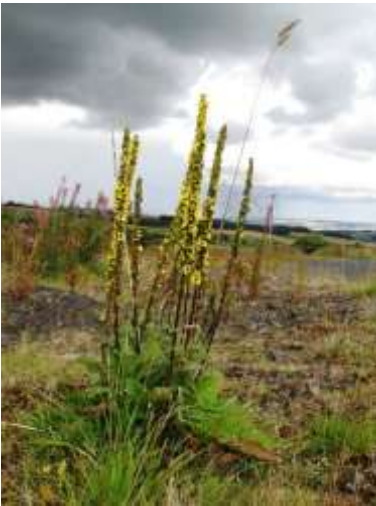
Dark Mullein Verbascum nigrum

A building site next to the Community Hospital was very productive. Species recorded included Garden Lady's-mantle Alchemilla mollis , Slender Sandwort Arenaria leptoclados , Purple Toadflax Linaria purpurea , Dark Mullein Verbascum nigrum and two most unexpected comfres: Caucasian Comfrey Symphytum caucasicum and Common Comfrey S. officinale . The latter, despite its name, had not been recorded before in Roxburghshire. It is a mystery where these two comfres could have come from. Mugwort Artemisia vulgaris was seen here and in two places along Commercial Road. Not far away, next to the Burns Club, another building site had a large population of Rat's-tail Fescue Vulpia myuros .