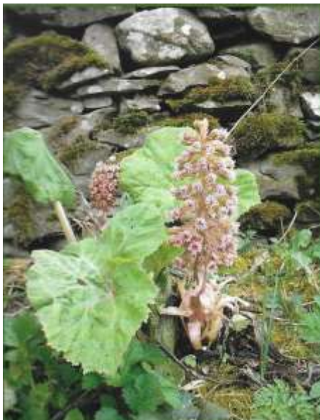
Common Butterbur Petasites hybridus

Butterbur found in the Scottish Borders is ‘male’, suggesting that it is an ancient introduction that has spread by root fragments being carried down watercourses and that seed production is a rare event. Hawick is one of the few places where ‘female’ plants also occur, one such patch is almost under the Albert Bridge. There are two other Butterburs, both relatively recent introductions which have naturalised down the Slitrig. The very early-flowering White Butterbur P. albus is well established at the foot of Whitlaw Wood and is also found by the Teviot below Mansfield and Weensland. Japanese Butterbur P. japonicus , with its curious pagoda-shaped flower spikes, appears to have been introduced at Colislinn and to have spread down the Slitrig as far as St Cuthbert’s Church. Sweet Cicely Myrrhis odorata (see map, intensively recorded) is another ancient introduction that was used for flavouring