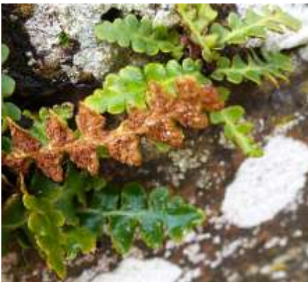
Rustyback Fern Asplenium ceterach

The cutting itself is very rich in ferns. The three most plentiful species are Hart's-tongue Fern Asplenium scolopendrium , Maidenhair Spleenwort A. trichomanes