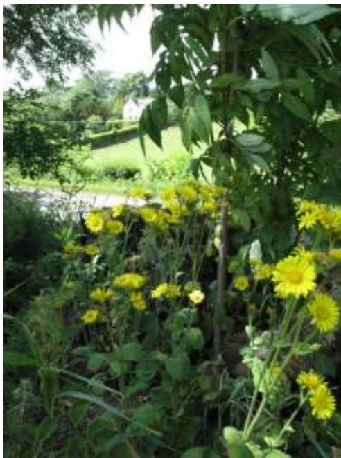
Leopard's-bane Doronicum pardalianches

A modest colony of Blue Anemone Anemone apennina flowers here in the spring. An introduction that is becoming widespread in the town and even a local nuisance is the orange-flowered hawkweed Fox-and-cubs Pilosella aurantiaca subsp. carpathicola . It is abundant on a bank by the road to Stirches by Wilton School which has an unexpected colony of Prickly Sedge Carex muricata subsp. pairae . Perennial Cornflower Centaurea montana , Leopard's-bane Doronicum pardalianches and Oriental Poppy Papaver pseudoorientale are garden throw-outs that have formed patches in several places, as in the Stirches housing where Lesser Knotweed Persicaria campanulata is a less common introduction.