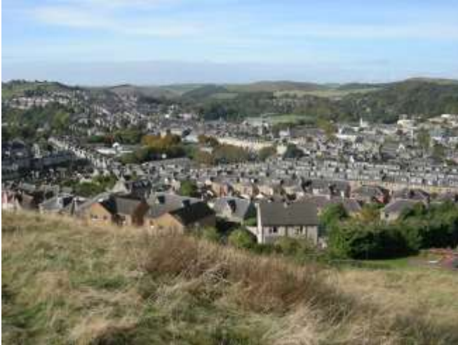
Hawick from the Miller's Knowes 2014

While the parks and cemeteries have vestiges of the former grassland flora of the area around the town there are much better-preserved examples out by the