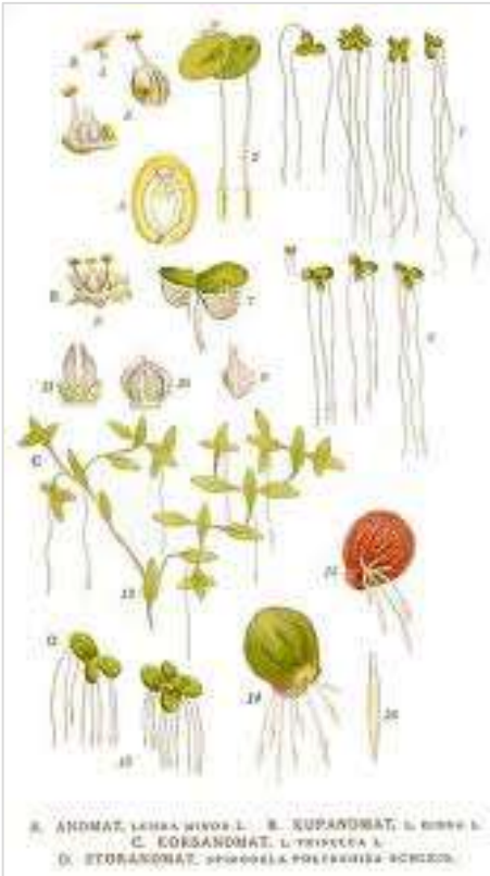
Duckweeds Lemna spp.

Although Hawick has rivers and burn there is extremely little in the way of ponds and wetland. There will have once been wetland on the haughs, but this has long been drained. Heronhill pond is the best on offer. It has a dam and is likely to have been a former mire. It is lined with planted trees except at the west end which is open to grazing. The trees include White Willow Salix alba , Osier S. viminalis , Aspen Populus tremula and Western Balsam-poplar P. trichocarpa . The Aspen has been recently introduced during work carried out by the Borders Forest Trust. There is no woodland flora as such except for the most unexpected