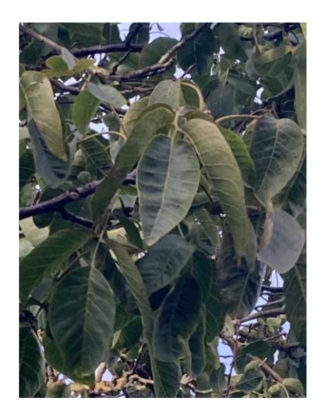
Distinctive leaves of Walnut

Juglans regia (Walnut). Planted on the verge at Jolby Lane near Croft-on-Tees in September by LR. NY94.25.