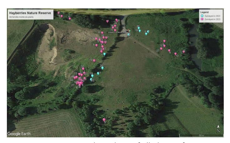
Positions and numbers of all plants of Alchemilla monticola

In 2022 Sue Thurley and myself (LR) counted and recorded all the plants of Alchemilla monticola in one section of Hayberries Nature Reserve near Eggleston. The remaining sections were surveyed by myself this year. The Reserve has been invaded by the garden escape Alchemilla mollis and hopefully some work parties will be organised this year to help dig this out. It needs to be done by people able to differentiate between the extremely rare Alchemilla monticola and this invader. Adding to the mix and confusion are plants of Alchemilla glabra and Alchemilla xanthochlora which are relatively common here. To help sort out the differences we will be having a Field Meeting to enable folk to identify these Alchemilla's.