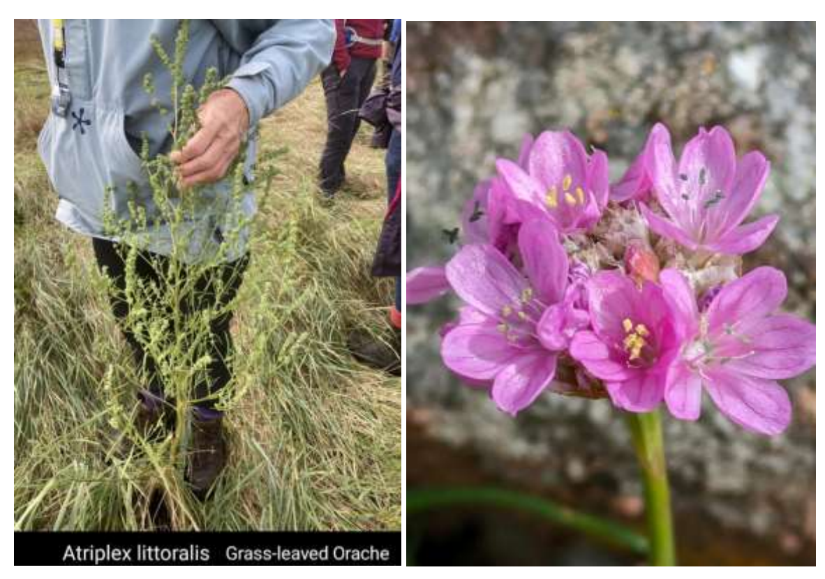
Grass-leaved Orache and Thrift

We were very pleased to find a row of huge plants of Grass-leaved Orache Atriplex littoralis growing along a fence line. This is quite a scarce plant in Kirkcudbrightshire and it was clearly thriving here! There were also all three of the typical sea shore sedges: Distant Sedge Carex distans , Long-bracted Sedge C. extensa and False fox-sedge C. otrubae .