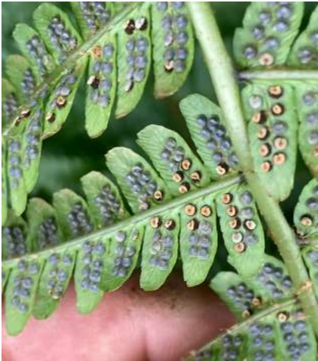
Indusia of D. pseudodisjuncta

Another species, D. lacunosa , rather resembles borreri and has big rectangular lobes with lots of double teeth. The dark spot where the pinna meets the rachis 'bleeds' along the costa.