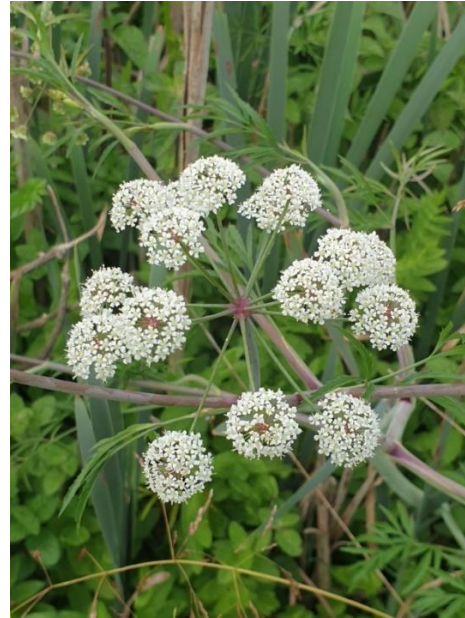
Cicuta virosa Mackworth D Lusher-Sellors

2.3 Poa bulbosa (Bulbous Meadow-grass) This was noted by Brian Gough on a WFS meeting to Dove Dale growing abundantly in thin soil over limestone near the Main car park (SK1451) on 13 th May.