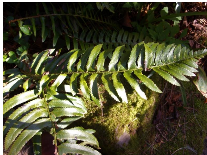
Polystichum munitum Limb Valley