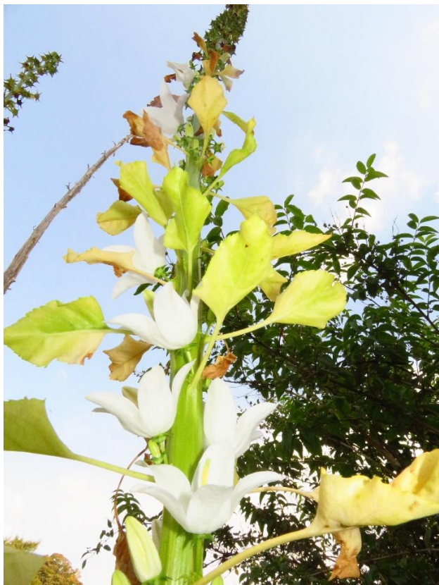
Campanula pyramidalis Calke D Giddins

3.2 Campanula pyramidalis (Chimney Bellflower) This was recorded growing on a wall round the walled garden at Calke Abbey (SK3722) by Darren Giddins 9 th September.