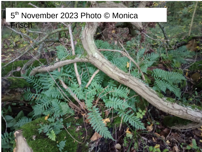
5 th November 2023

The third location was high in the canopy but is now at ground level – the logs from the fallen oak – where it is thriving.