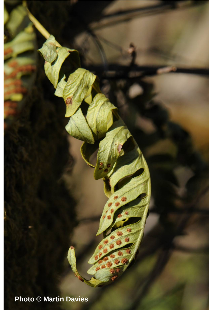
Photo shows frond shrivelled due to spring drought in April 2022.

Do only certain trees provide the appropriate environmental conditions for it to thrive?