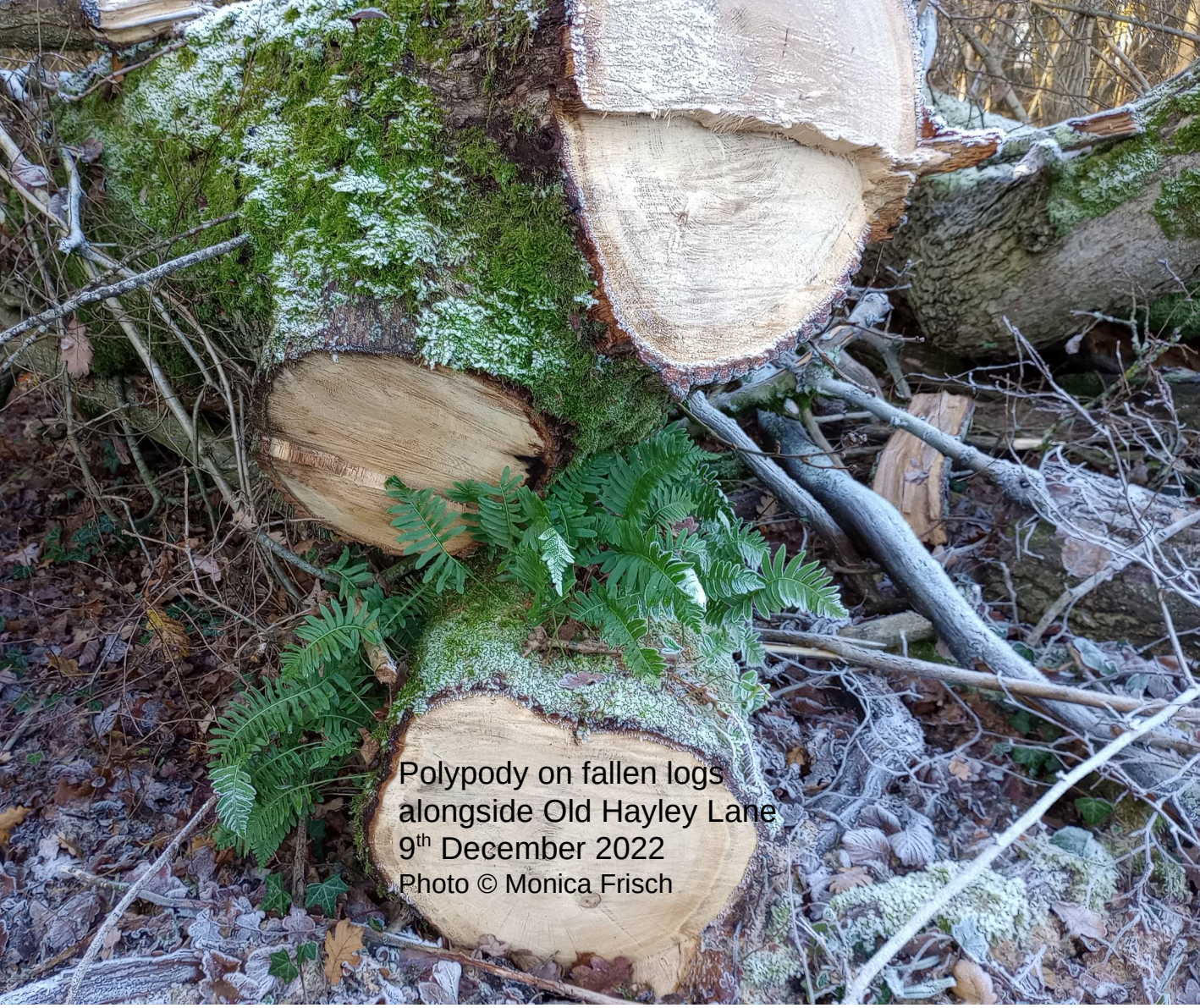
Polypody on fallen logs alongside Old Hayley Lane 9 th December 2022