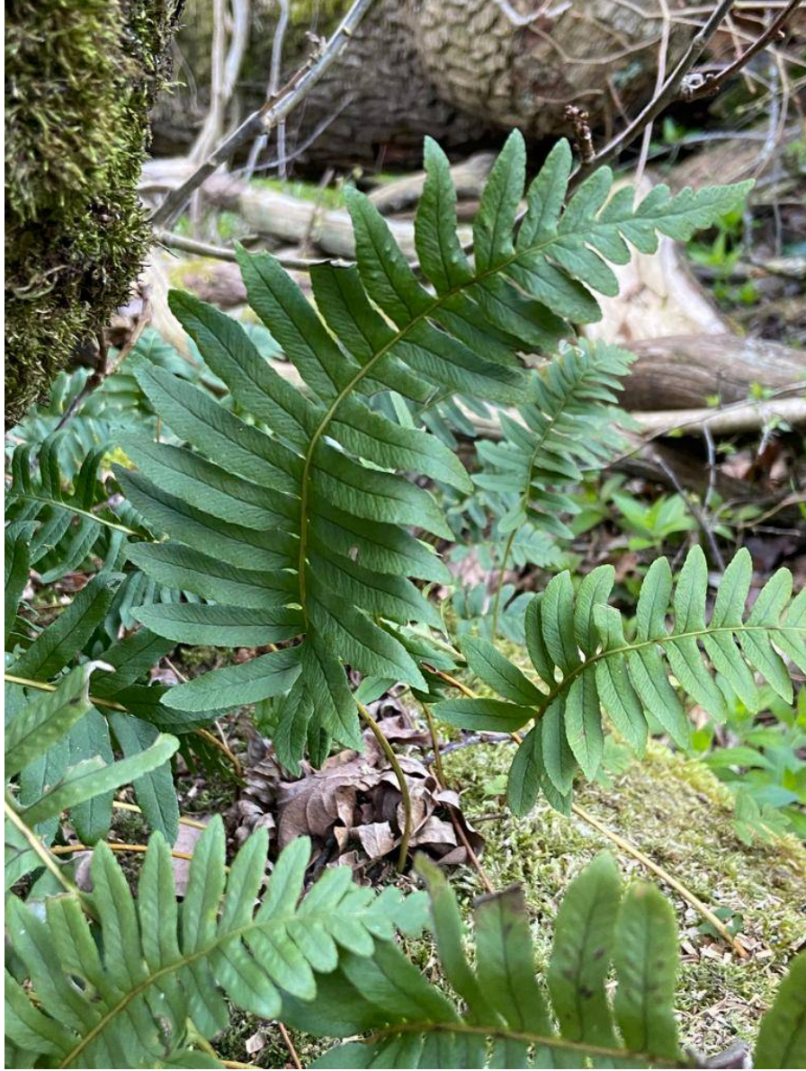
Close-up of Polypody fronds and of sporangia