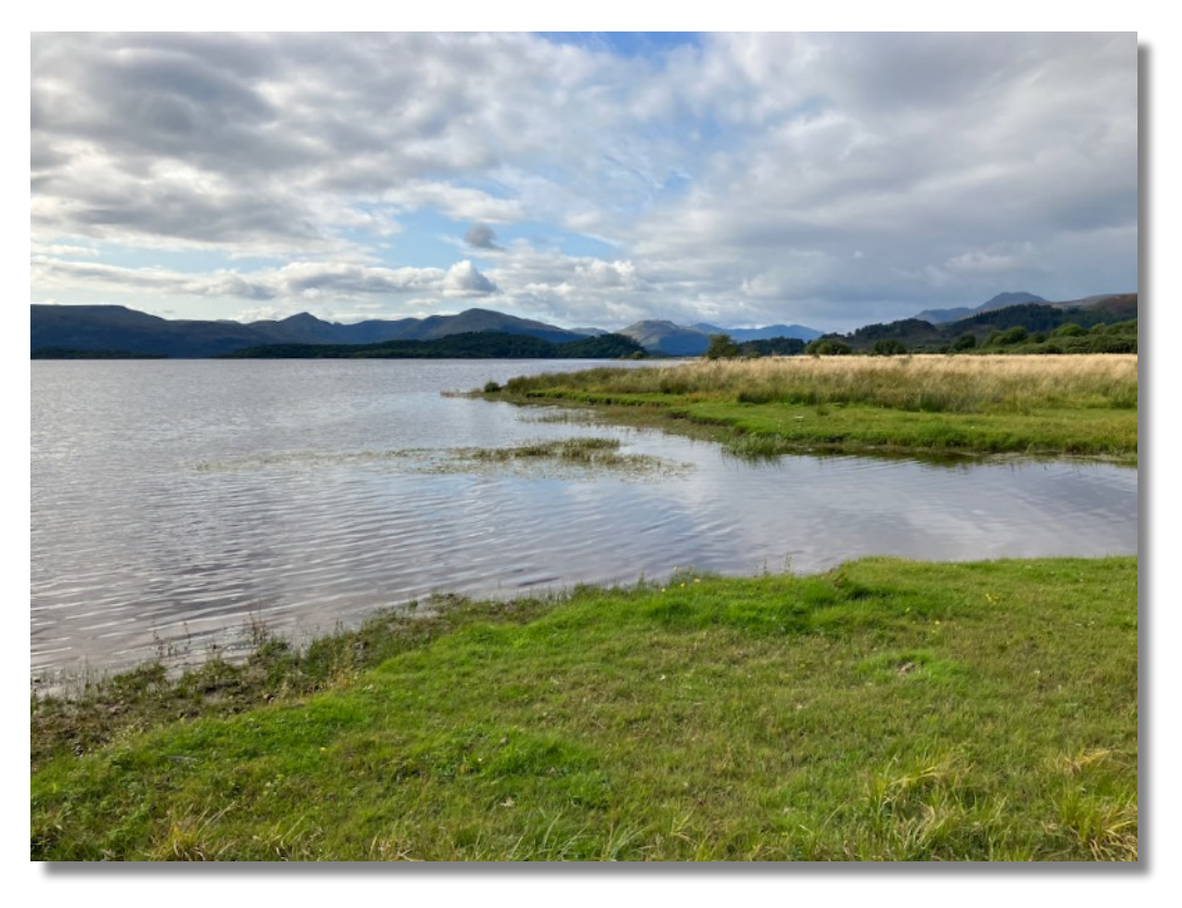
The tranquility of Ring Point on the RSPB Loch Lomond Reserve