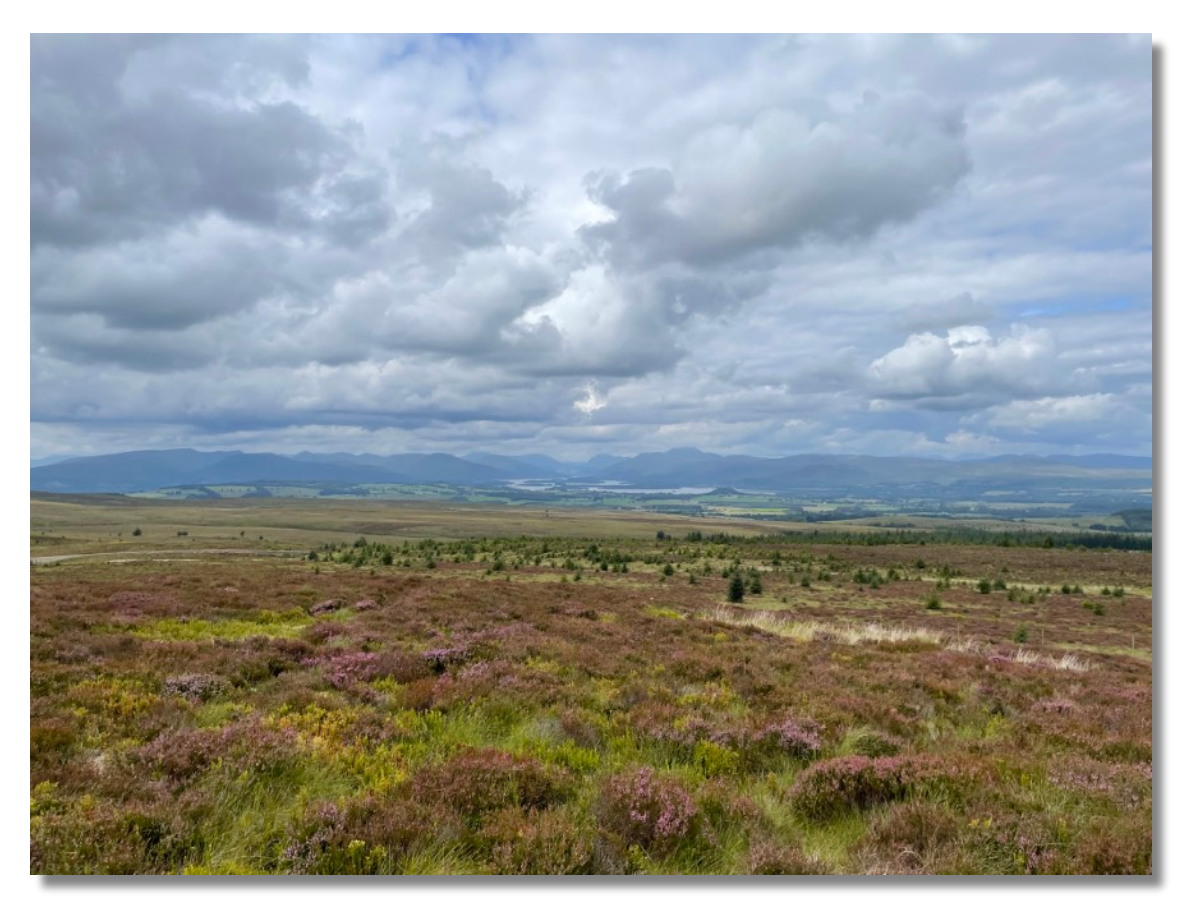
A stunning view northwards towards Loch Lomond from the summit of Dumbarton Muir

This edition of the Newsletter is a patchwork of short items of interest, looking both backward at another busy year of botanical recording and forward to some of what next year may hold in store.