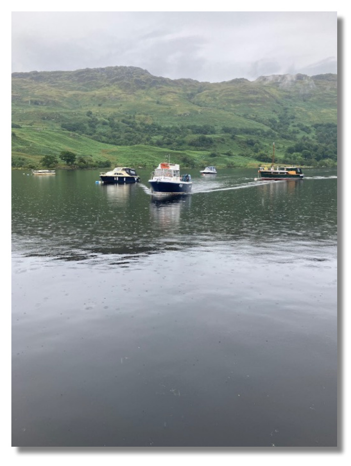
The Ardlui ferry returning with botanists after a wet day

Here is a flavour of some of our Outings Programme in 2023: