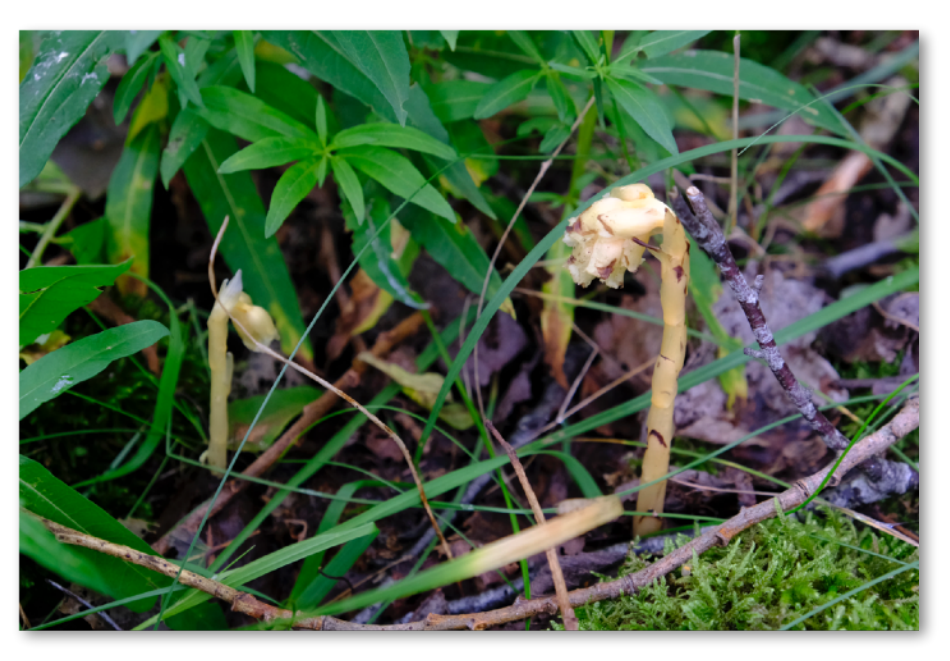
Hypopitys monotropa (Yellow Bird's-nest) at Ravenscraig