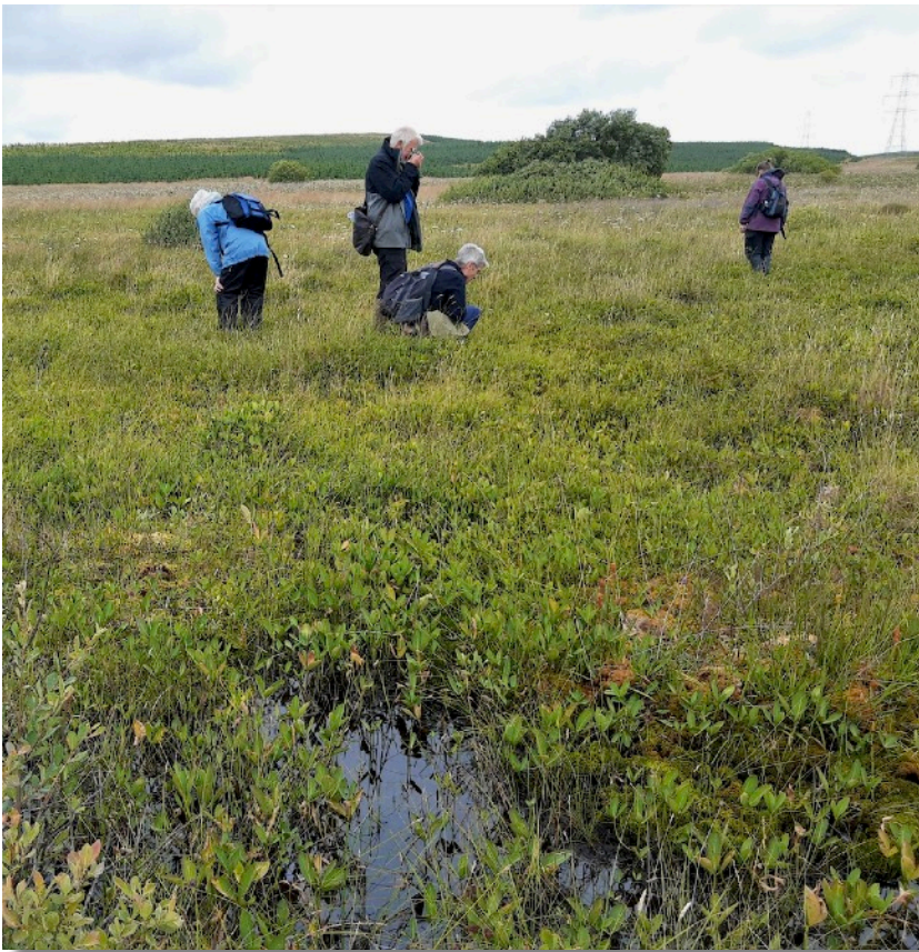
Keith led an expedition to Knockmade Moss

Here is a flavour of our Outings Programme in 2023: