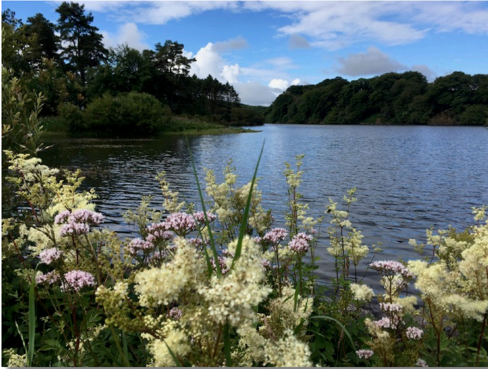
Barcraigs Reservoir on a perfect summer's day

This edition of the Newsletter is a patchwork of short items of interest, looking both backward at another busy year of botanical recording and forward to some of what next year may hold in store.