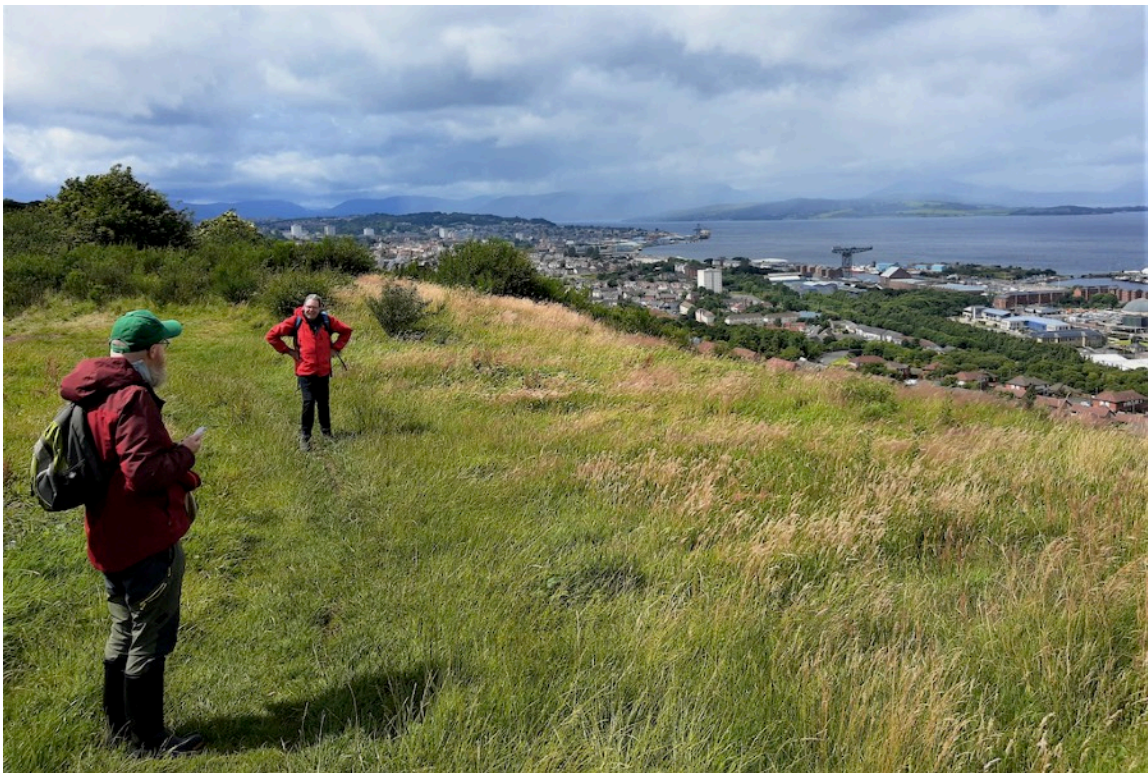
Jim led an outing at Gibshill, above Greenock