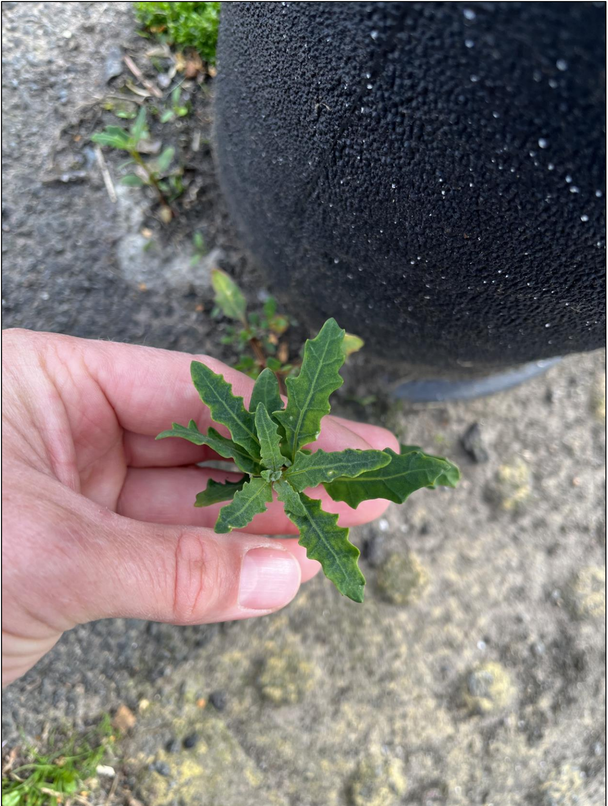
Chenopodium glaucum ( Oxybasis glauca ) – Oak-leaved Goosefoot, VC87