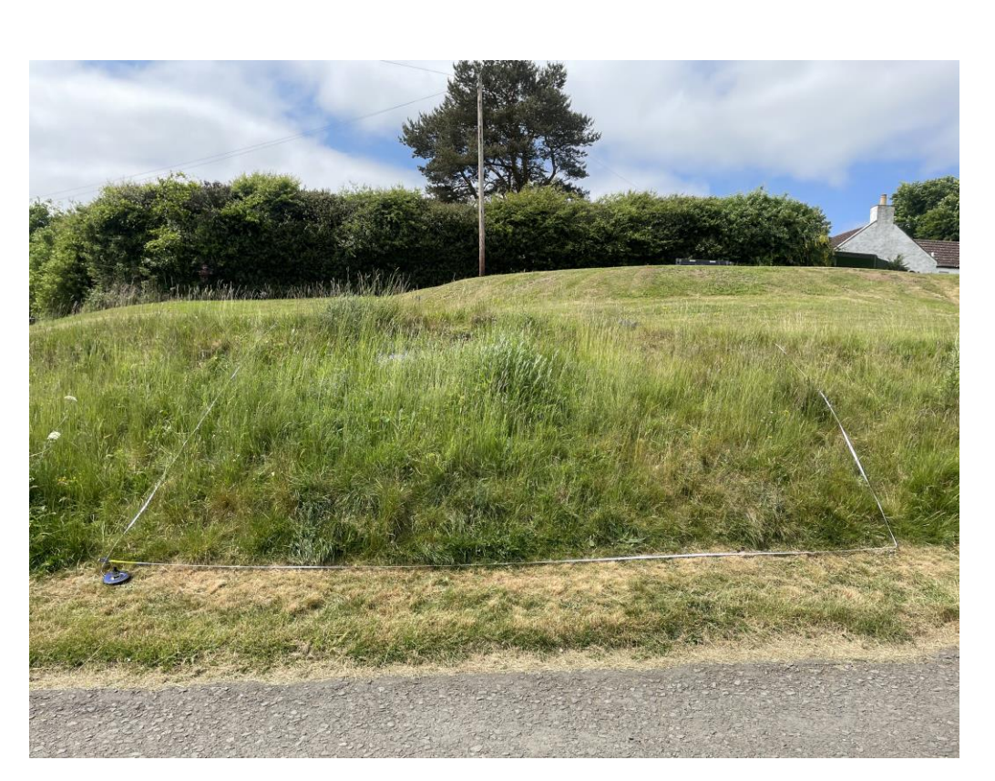
Different mowing regimes at the recreation ground in Leslie

Native species were recorded more frequently than neo- or archaeophytes (Fig 1), and were more abundant.