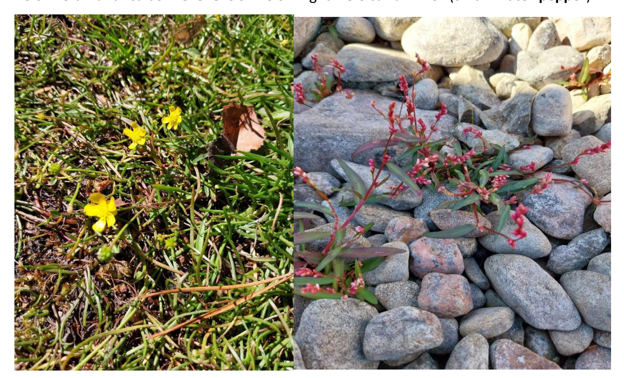
Below left: Ranunculus x levenensis. Below right: Persicaria minor (Small Water-pepper)

In the loch we found several species including a small piece of Potamogeton berchtoldii (Small Pondweed) a species not recorded from the loch before. A good stand of Sparganium angustifolium (Floating Bur-reed) with long narrow leaves floating on the water surface. While on the stoney bottom of the loch and the stoney shore of the loch there were massive of Littorella uniflora (Shoreweed). While on the stoney shore around the loch there were plenty of Carex viridula (Small-fruited Yellow-sedge).