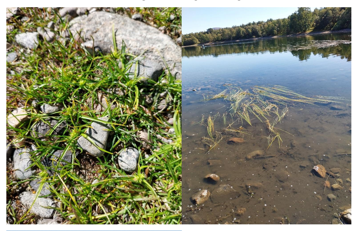
Below left: Small-fruited Yellow-sedge . Below right: Floating Bur-reed .