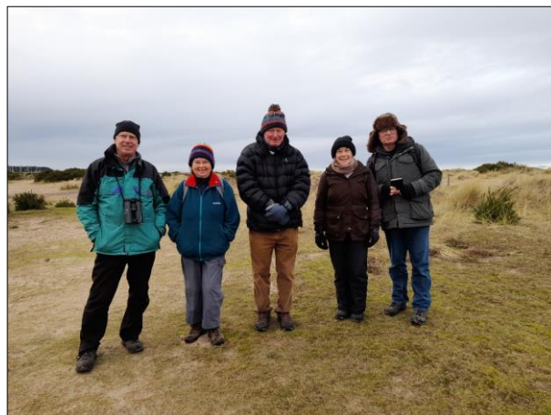
Ulex europaeus (Gorse) in flower during the New Year Plant Hunt, left, and the group, above