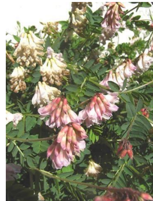
Vicia orobus (Upright Vetch)