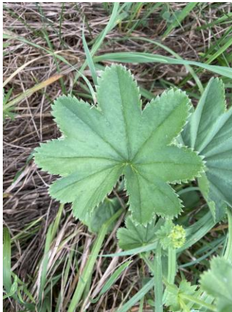
Classic Alchemilla monticola leaf