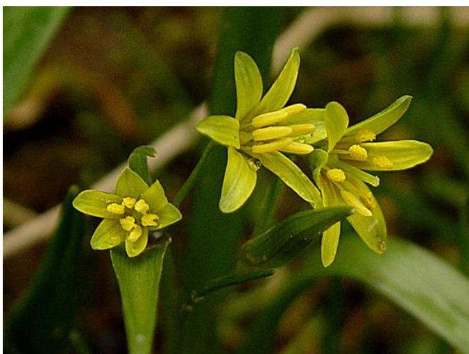
Gagea lutea (Yellow Star of Bethlehem)

Welcome to this our 15th newsletter for v.c.65 which is intended to keep you up-to date with botanical activities in North-west Yorkshire. For geographical details of the vice county please visit our website at: https://bsbi.org/north-west-yorkshire and click on 'A brief tour of v.c.65'.