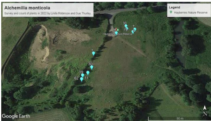
Positions and numbers of plants of Alchemilla monticola